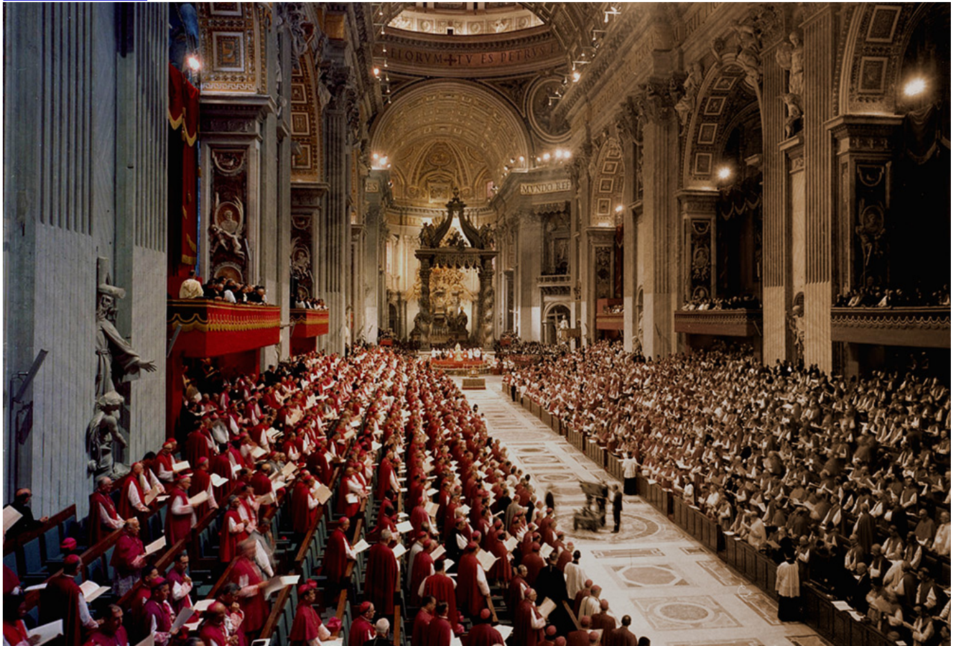
Bishops fill St. Peter's Basilica during a meeting of the Second Vatican Council.