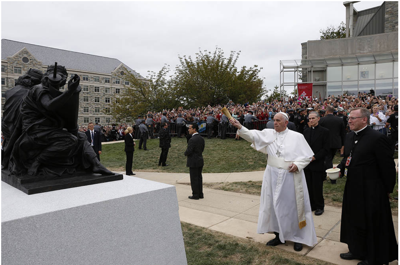
At St. Joseph's University in Philadelphia Sept. 27, 2015, Pope Francis blesses a sculpture commemorating the 50th anniversary of "Nostra Aetate," the Second Vatican Council Declaration on the Relationship of the Church to Non-Christian Religions.

Moreover, if in the theological interpretation of Vatican II one does not include the discontinuities of documents like Dignitatis Humanae on religious liberty and Nostra Aetate on non-Christian religions, the whole "good Catholic conservatives vs. progressives as false prophets" narrative becomes a caricature.