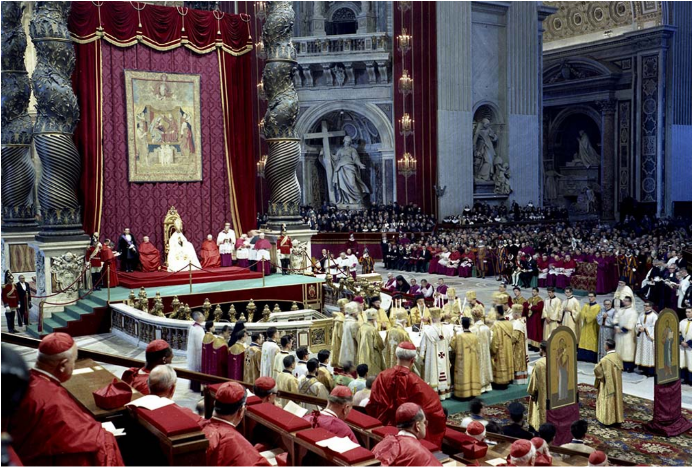
Pope Paul VI presides over a meeting of the Second Vatican Council in St. Peter's Basilica at the Vatican in 1963.

The history of the magisterium teaches us that not all changes are ruptures, and not all material continuities with the previous tradition ensure continuity with the Gospel. It is also misleading to say that "the same magisterium that gave us the ecumenical council of Vatican II also gave us Pope Benedict XVI's motu proprio [ Summorum Pontificum on the 'traditional Latin Mass']," almost implying that the teaching of a general council like Vatican II and the motu proprio of a pope are on the same level of authority.