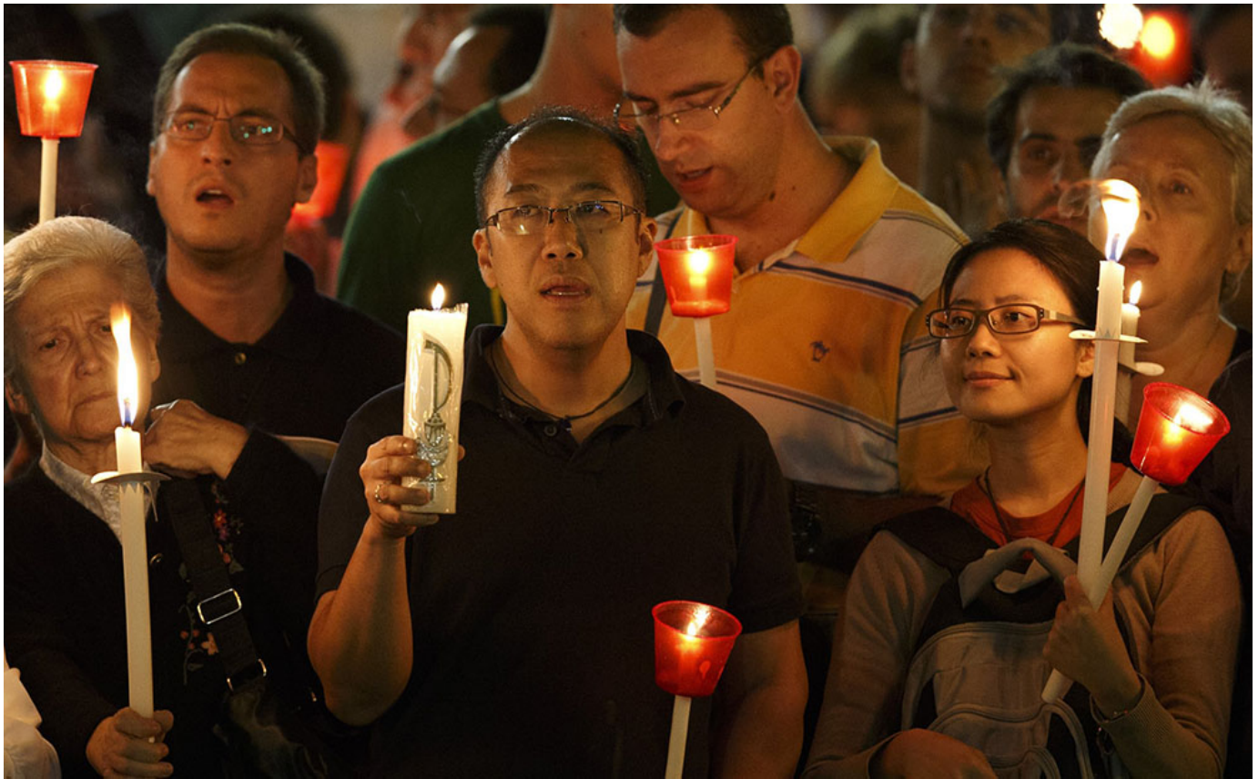
Pilgrims attend a candlelight vigil in St. Peter's Square at the Vatican Oct. 11, 2012, to mark the 50th anniversary of the opening of the Second Vatican Council.

The problem is that the texts of Vatican II are not just the four constitutions presented in this volume: There are 12 more of them. Someone who would start to learn about Vatican II from this volume would have no way of knowing that. It is true that the four constitutions belong to a higher category of conciliar teachings, but this assumption has been relativized in the post-Vatican II period, and not just by progressive theologians, but also by popes, if one looks, for example, at the role of the declaration Nostra Aetate on non-Christian religions in the pontificate of Pope John Paul II (not to mention Francis).