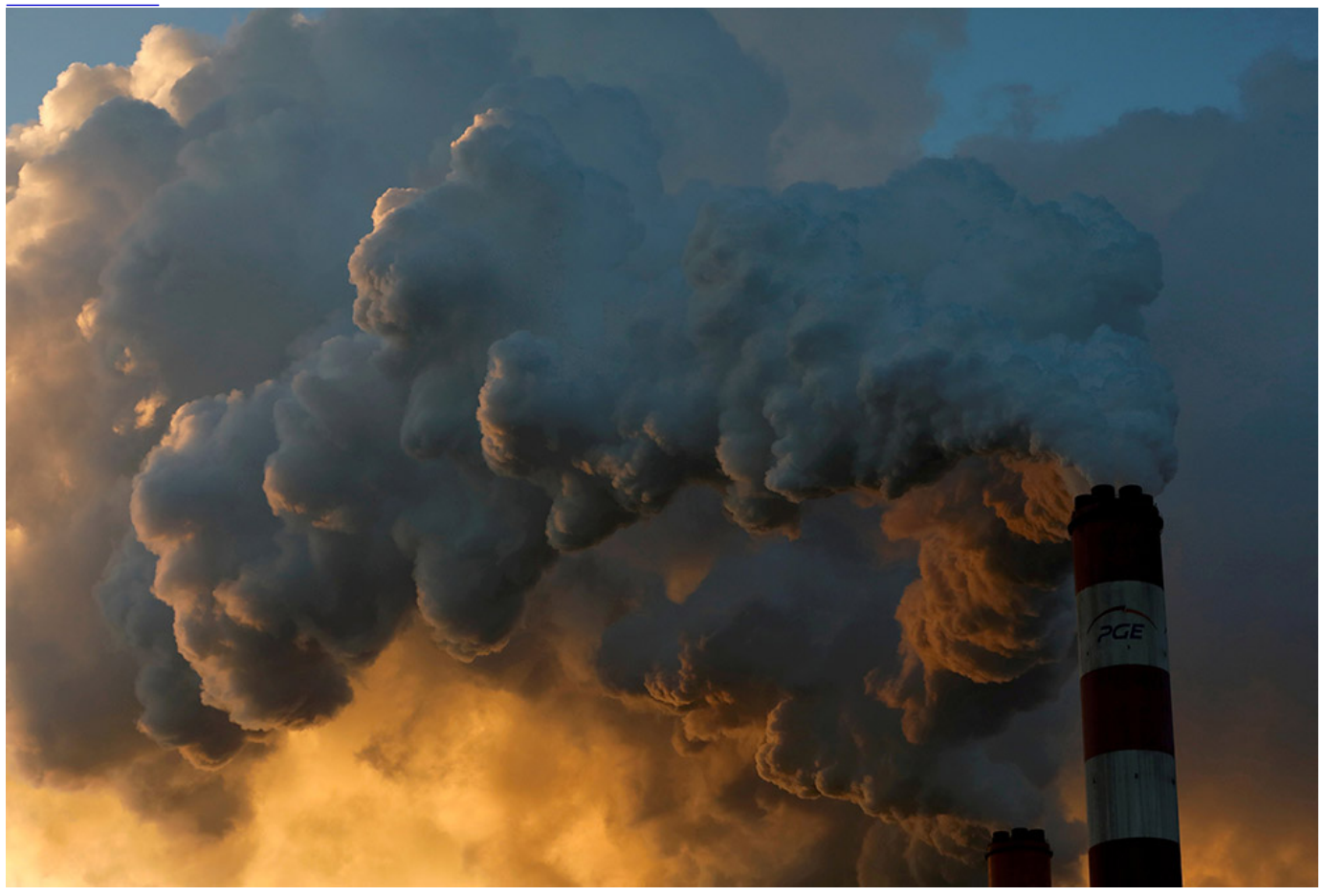
A coal-fired power plant is seen in this illustration photo.