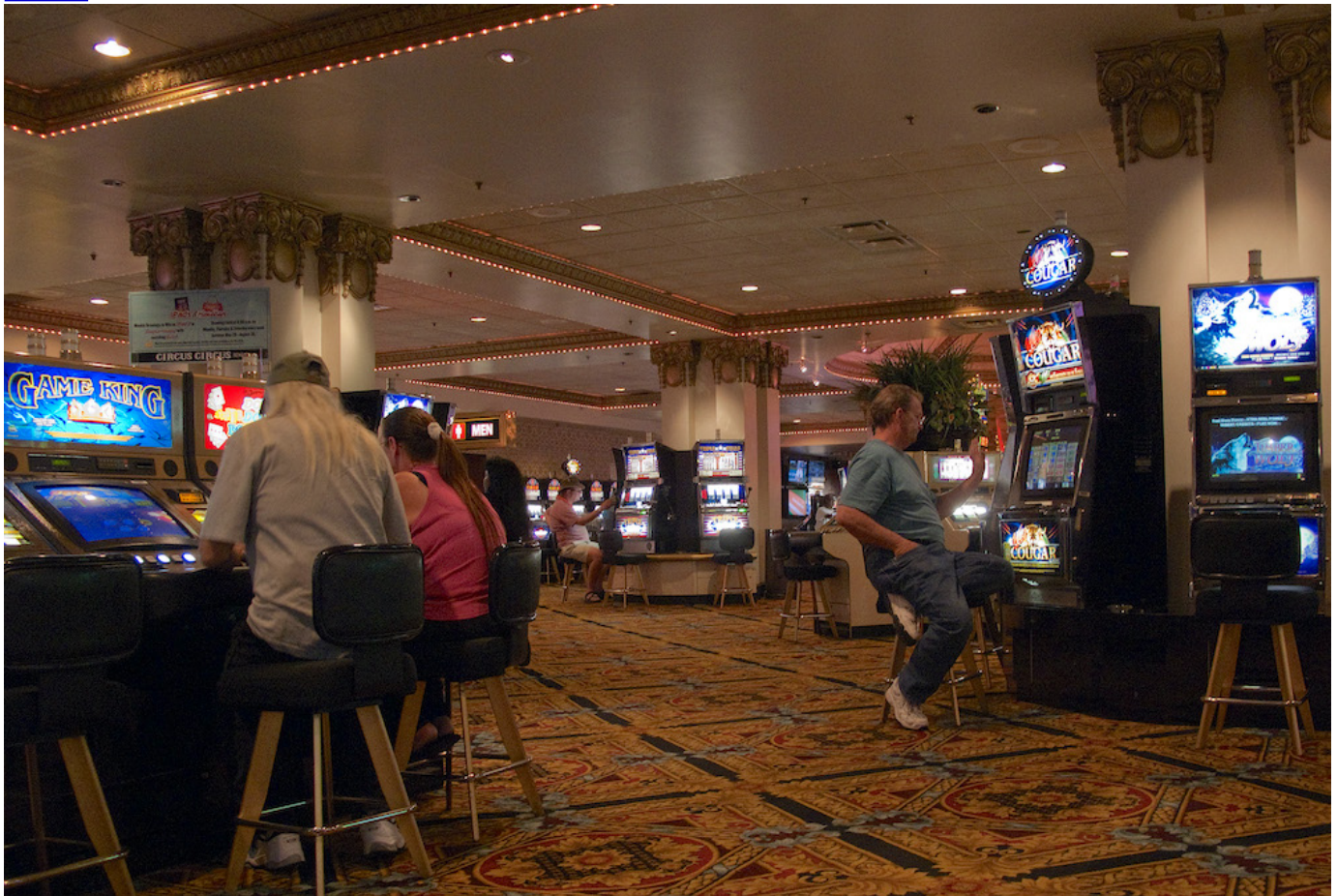
People gamble at the slot machines at Circus Circus in Reno, Nevada, July 2012.