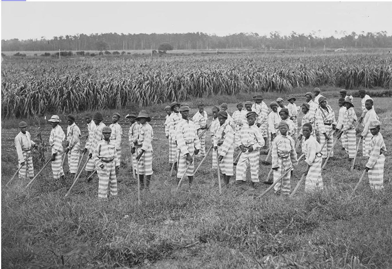
Juvenile convicts at work in fields, circa 1903