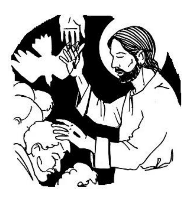
"Behold, I am with you until the end of time" (Matthew 28:20).

Dt 4:32-34, 39-40; Ps 33; Rom 8:14-17; Matt 28:16-20