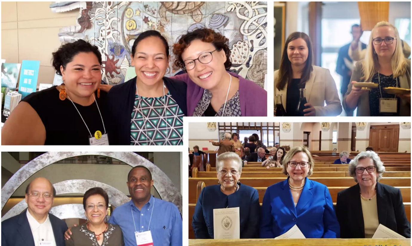
Photos from more recent past conventions of the Catholic Theological Society of America