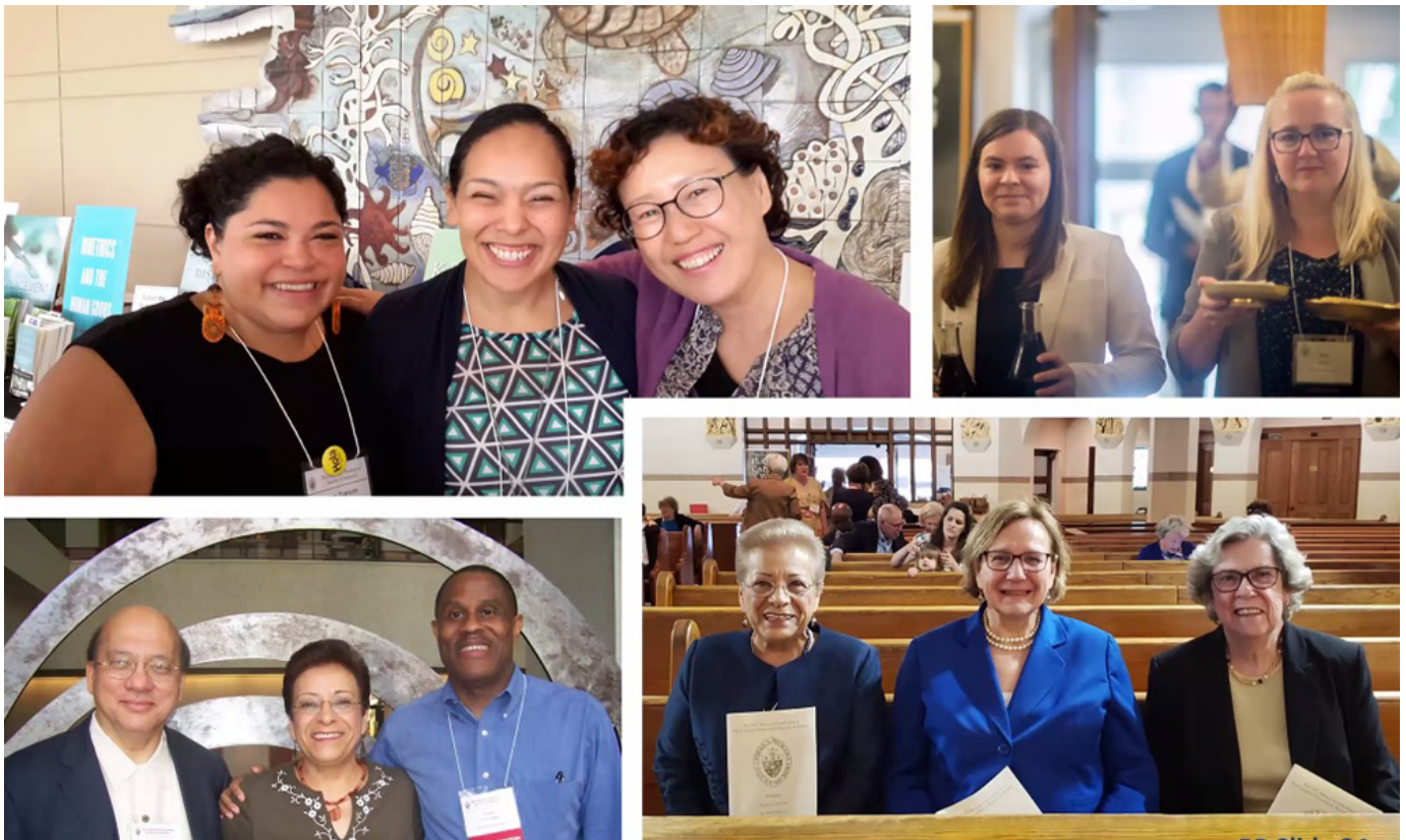
Photos from more recent past conventions of the Catholic Theological Society of America