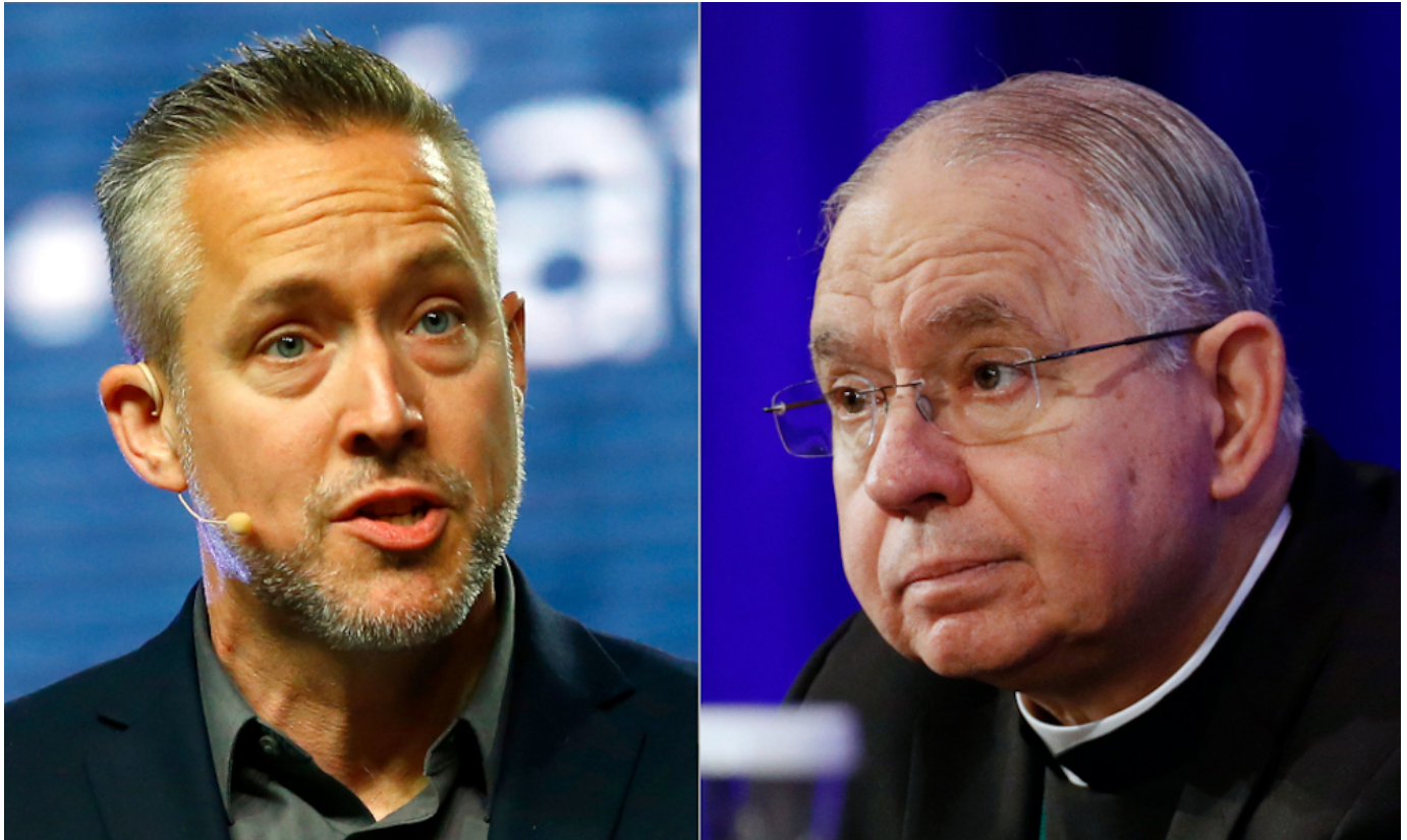
Southern Baptist Convention President J.D. Greear, left, and U.S. bishops' conference president Archbishop Jose Gomez.

(Interestingly, although the Catholic Church forbids women from becoming priests, it does allow them to preach, as long as their talk is not a homily. These are the kind of canonical distinctions Catholics thrive on. A homily is defined as a sermon given by a priest at Mass after the reading of the Gospel. Laymen and women cannot give homilies. However, they can give "reflections" on the readings, a legal loophole big enough for a smart pastor to drive a truck through.)