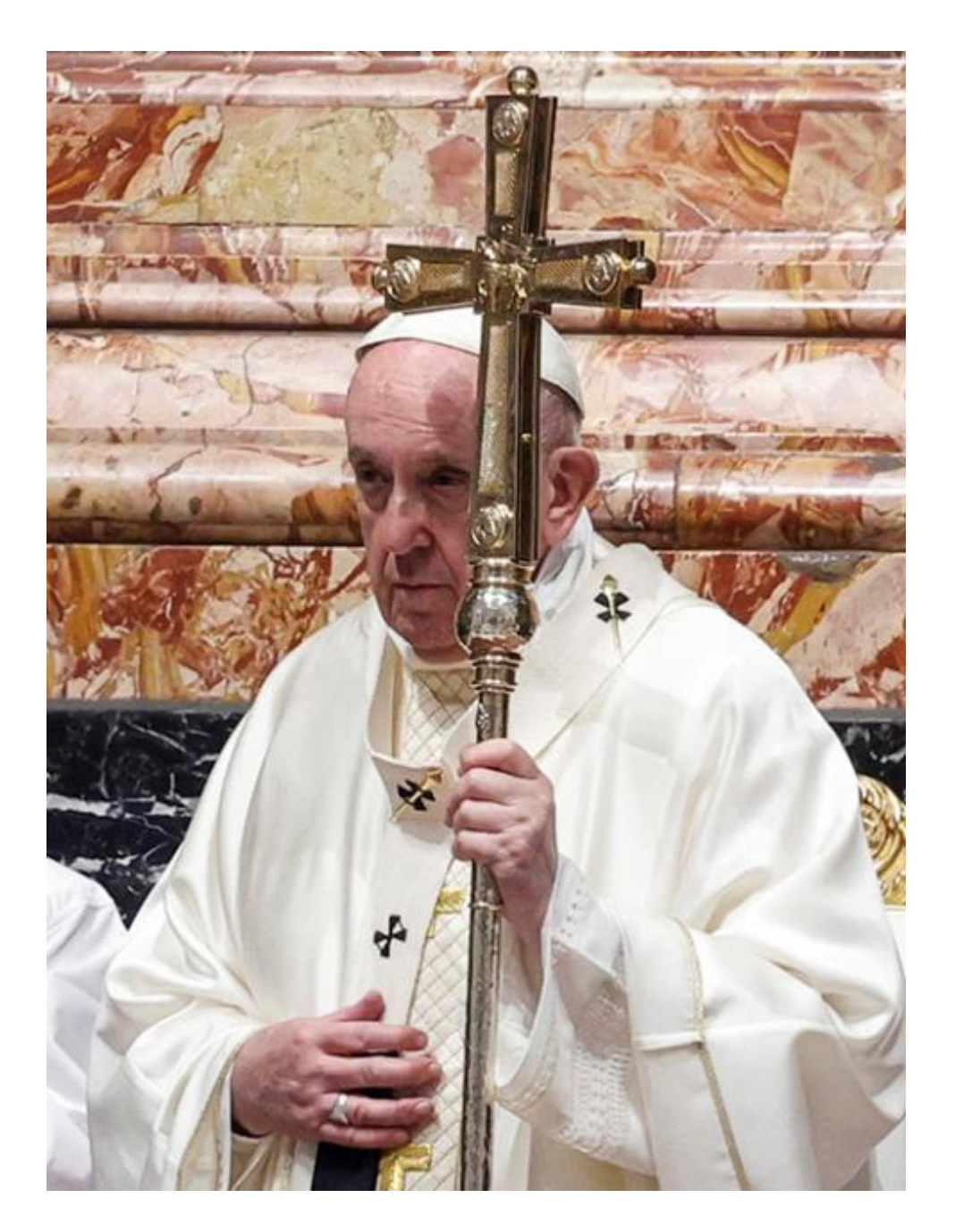
Pope Francis celebrates Mass in St. Peter's Basilica at the Vatican June 6.