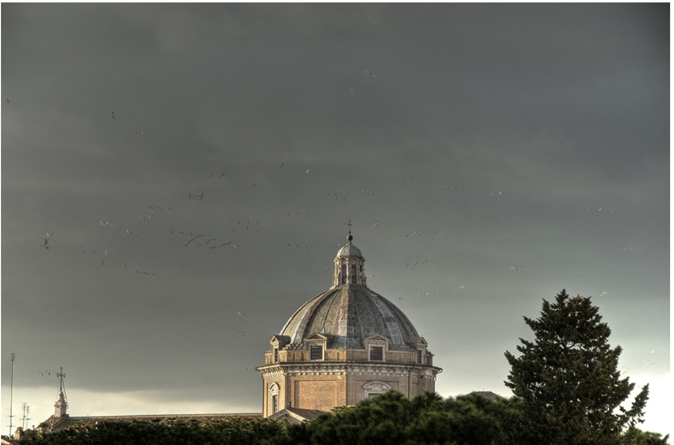
The dome of the Church of the Gesù, the mother church of the Society of Jesus in Rome