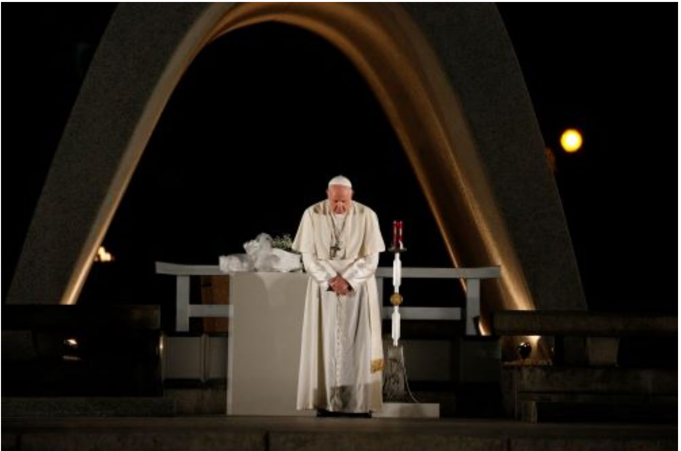
Pope Francis participates in a moment of silence at the Hiroshima Peace Memorial in Japan in 2019. "The use of atomic energy for purposes of war is immoral, just as the possessing of nuclear weapons is immoral," the pope said during that visit.

Today, I want you to feel in this hall the presence of all those who perished in Hiroshima and Nagasaki. I want you to feel, above and around us, a great cloud of a quarter-million. ...souls. Each person had a name. Each person was loved by someone. Let us ensure that their deaths were not in vain. ... The development of nuclear weapons signifies not a country's elevation to greatness, but its descent to the darkest depths of depravity. These weapons are not a necessary evil; they are the ultimate evil.