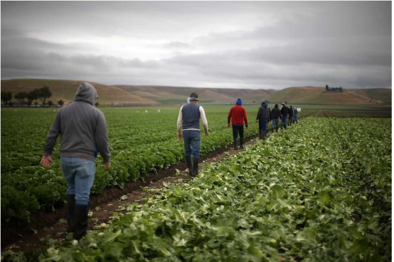
Migrant farmworkers with H-2A visas harvest romaine lettuce in King City, California, April 17, 2017.