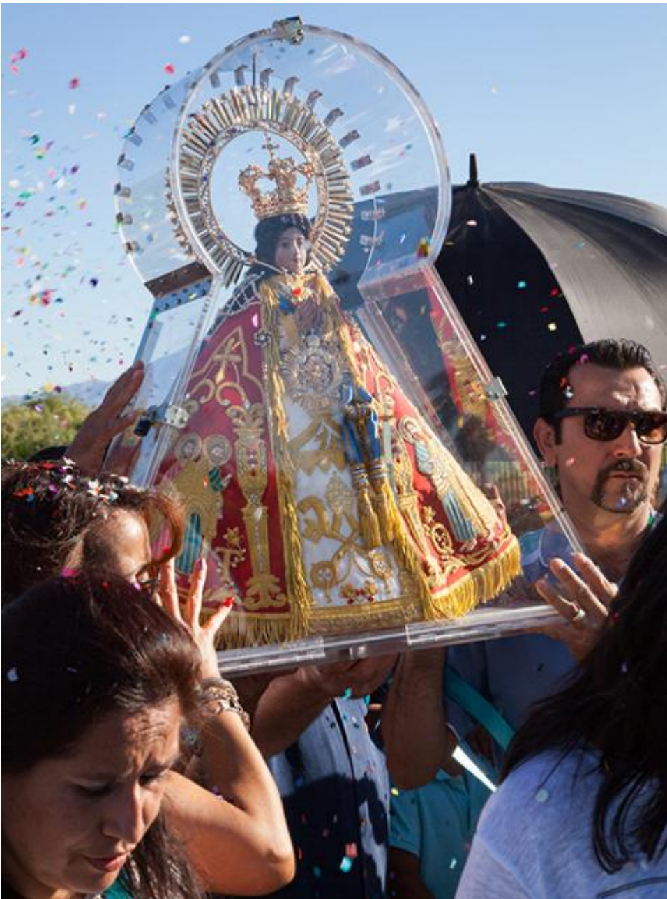
Photo from Noé Montes, an artist who comes from a family of migrant farmworkers, taken in Mecca, California, during an annual visit of La Virgen de Zapopan to the United States in 2015. (Courtesy of Noé Montes)

Rangel said that at the beginning of the pandemic many farmworkers were not given masks or their employers attempted to charge them for personal protective equipment. Others reported that workers were required to bring their own toilet paper to the fields.