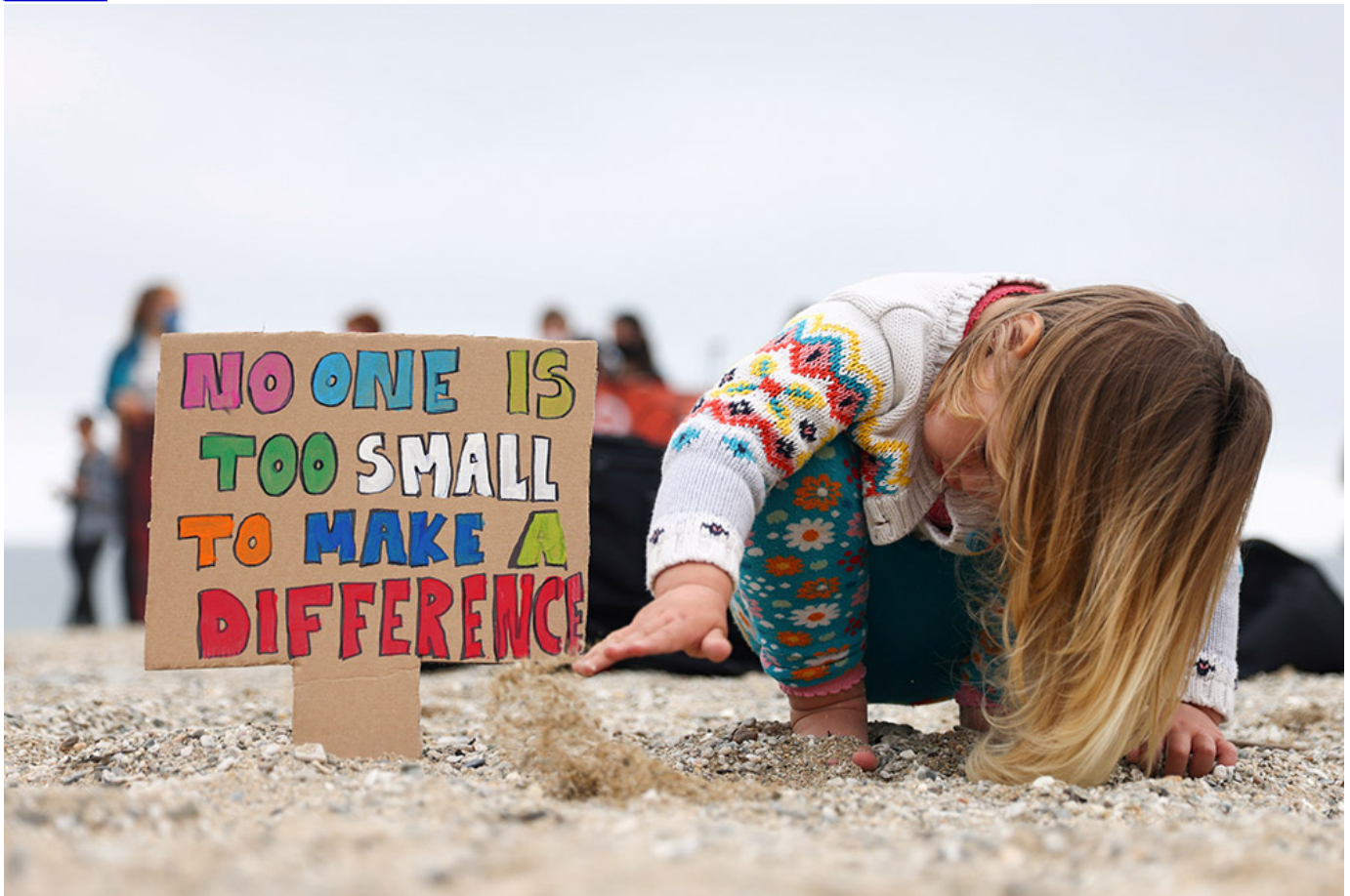
A girl in Falmouth, Britain, plays with sand during a climate protest June 11.