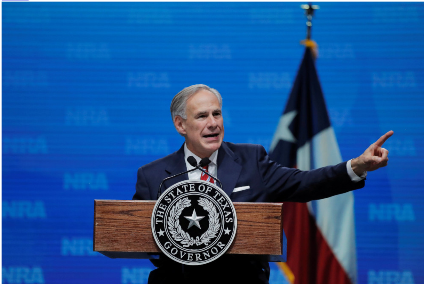
Texas Gov. Greg Abbott is seen in this 2018 file photo.