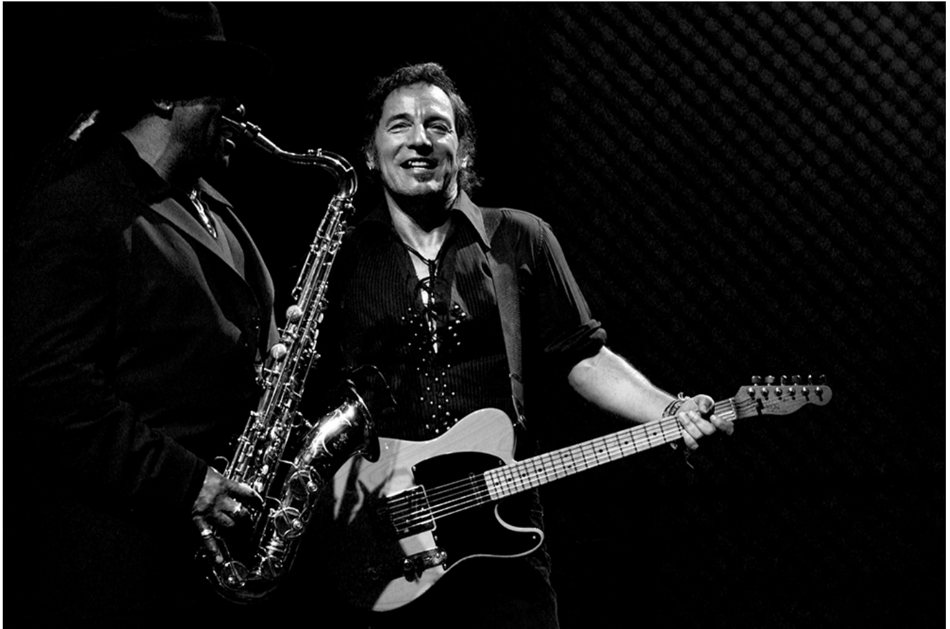
Bruce Springsteen performs with E Street Band member Clarence Clemons, left, during "The Rising" tour in 2003.