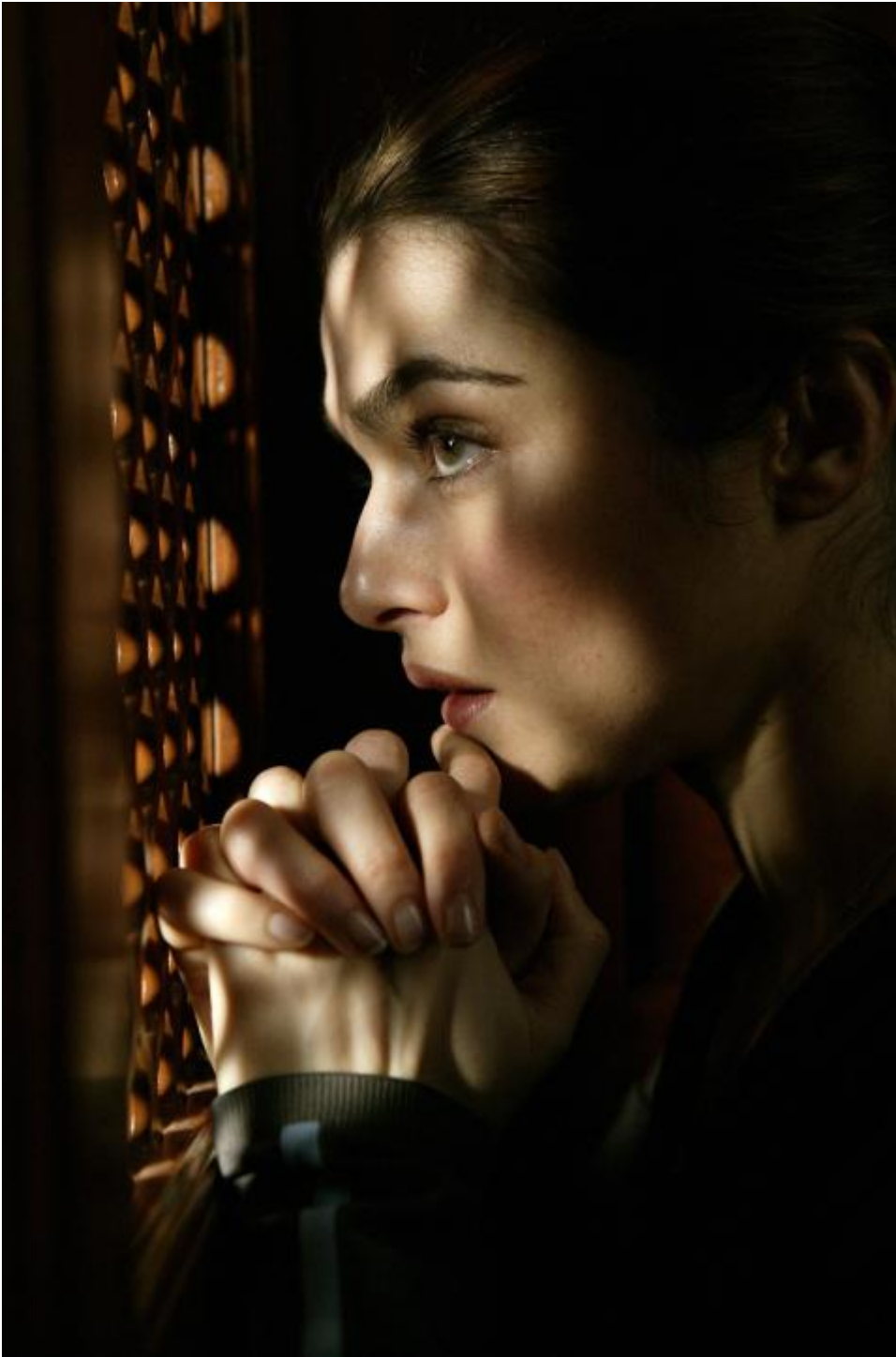
Rachel Weisz in a scene from the 2005 movie "Constantine"