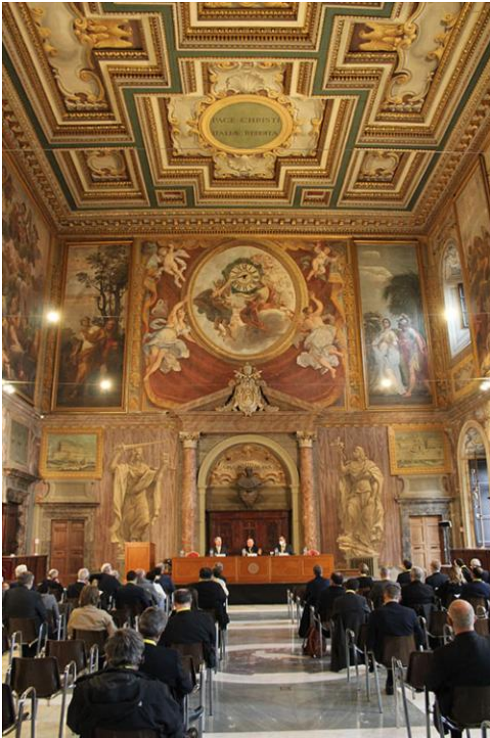
A symposium on "The Challenge of Artificial Intelligence for Human Society and the Idea of the Human Person," organized by the Vatican's Pontifical Council for Culture and the German Embassy to the Holy See, is held Oct. 21 at the Palazzo della Cancelleria in Rome.