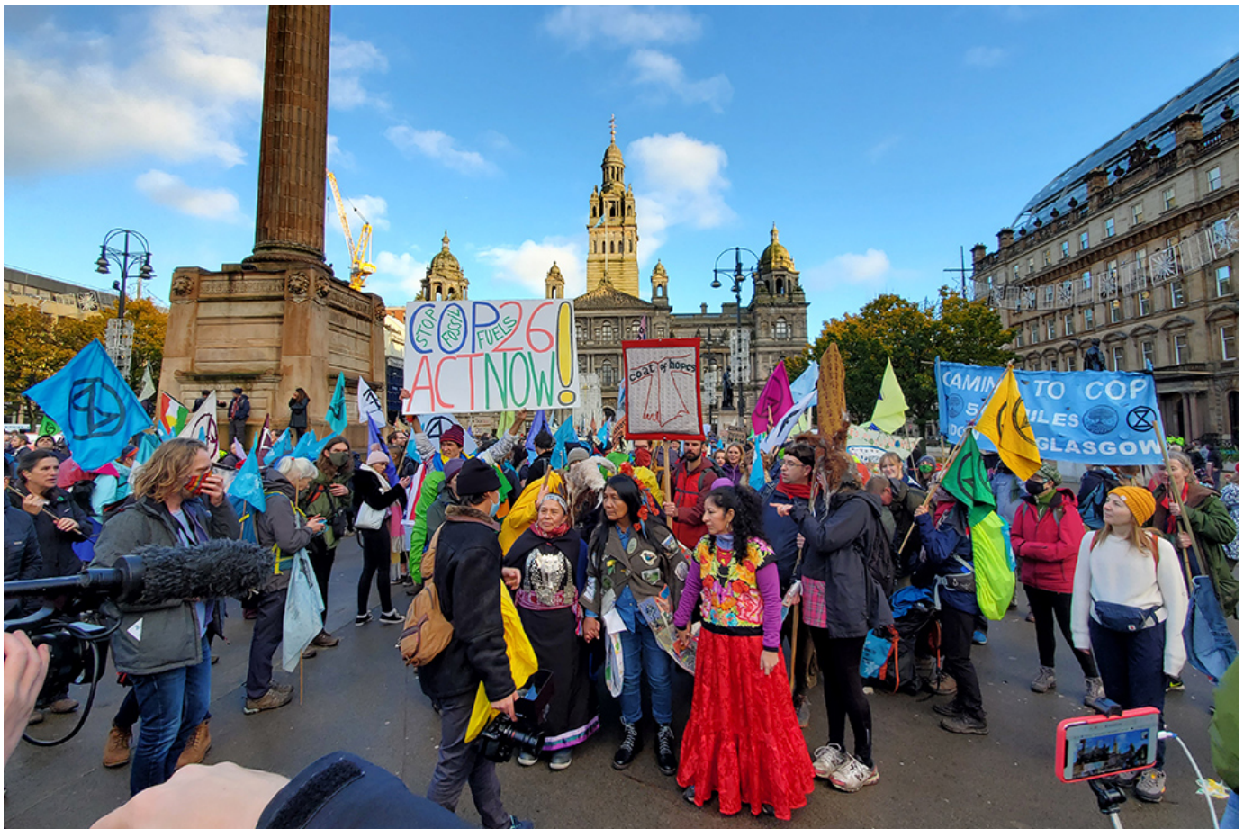
Climate activists, many from faith-based groups, arrive in Glasgow, Scotland, Oct. 30, 2021, ahead of COP26.

He called on rich nations to take the lead in mobilizing funds to finance responses to climate change, decarbonizing the global economy and helping the most vulnerable countries and peoples to mitigate and adapt to global warming "and to respond to the loss and damage it has caused."