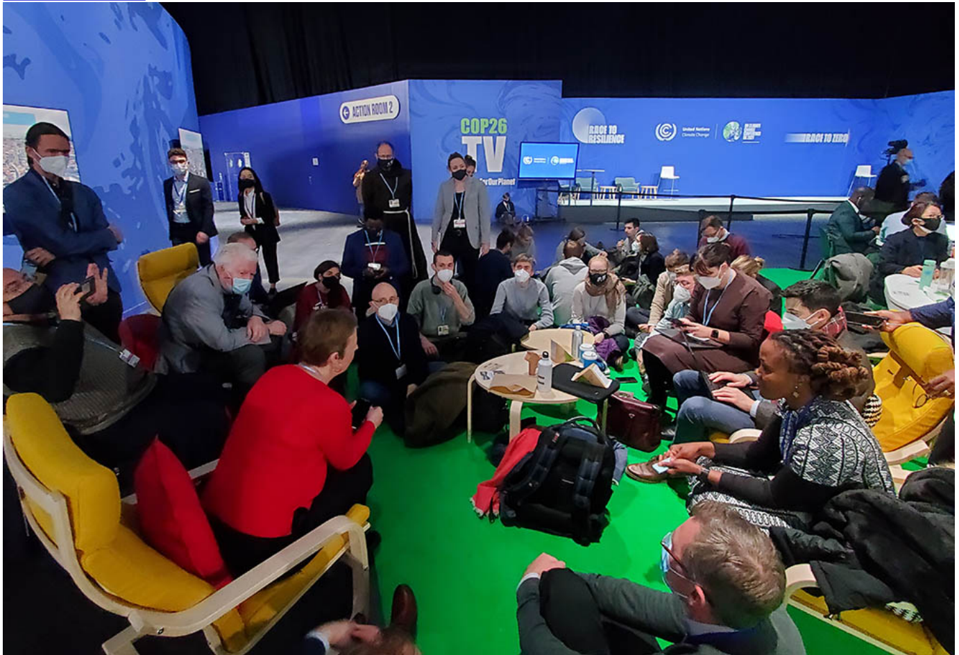
Catholics working on climate issues gather Nov. 4 between events at COP26 in Glasgow, Scotland.