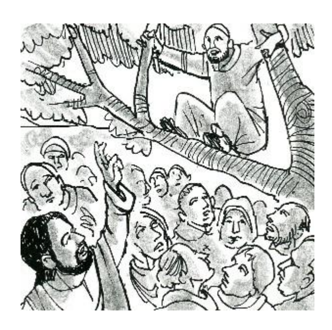
Pencil Preaching will be on the road from Nov. 17 to 21. Posts will resume on Monday, Nov. 22.

"He has gone to stay at the house of a sinner" (Luke 19:6).