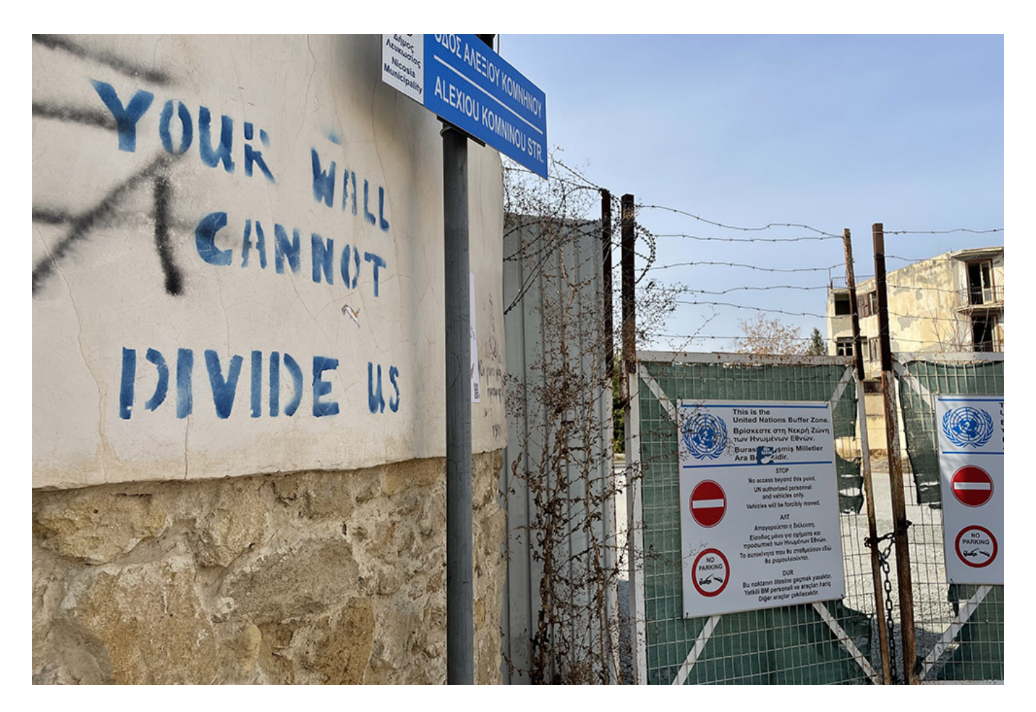
"Your Wall Cannot Divide Us" reads graffiti outside of the UN buffer zone of Nicosia.

"By age 7, my family had moved three times," he said, describing his early nomadic existence due to the conflict between the Greek and Turkish Cypriots.