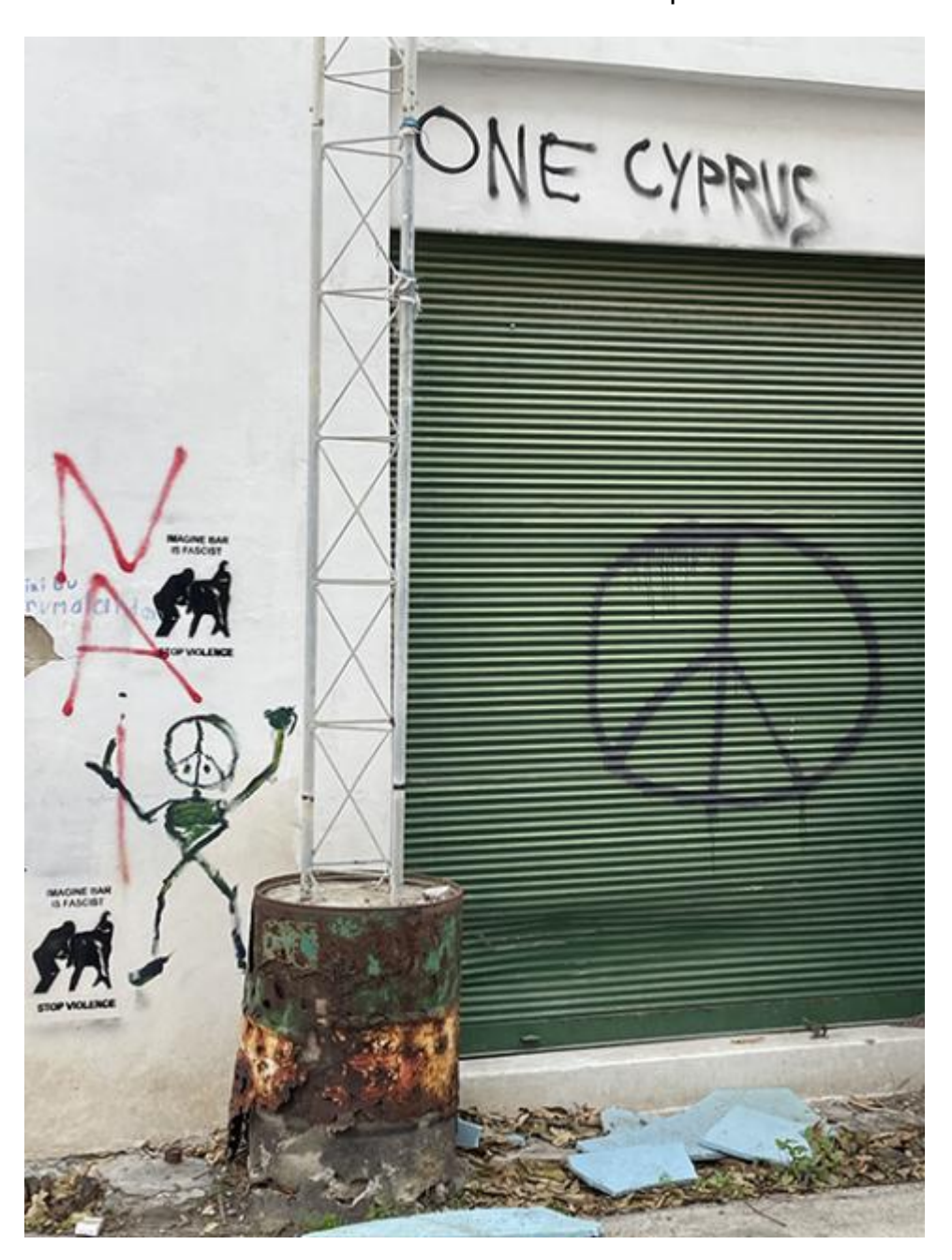
Calls for "One Cyprus" are written in graffiti in the U.N. controlled buffer zone in Nicosia.

Yet despite its efforts to bring together both Greek and Turkish Cypriots, the Home for Cooperation cannot provide a permanent residence for the likes of Ejuba. Instead, its mission is to provide a space for encounters for neighbors on both sides of the "Green Line" that has divided the capital since 1974.