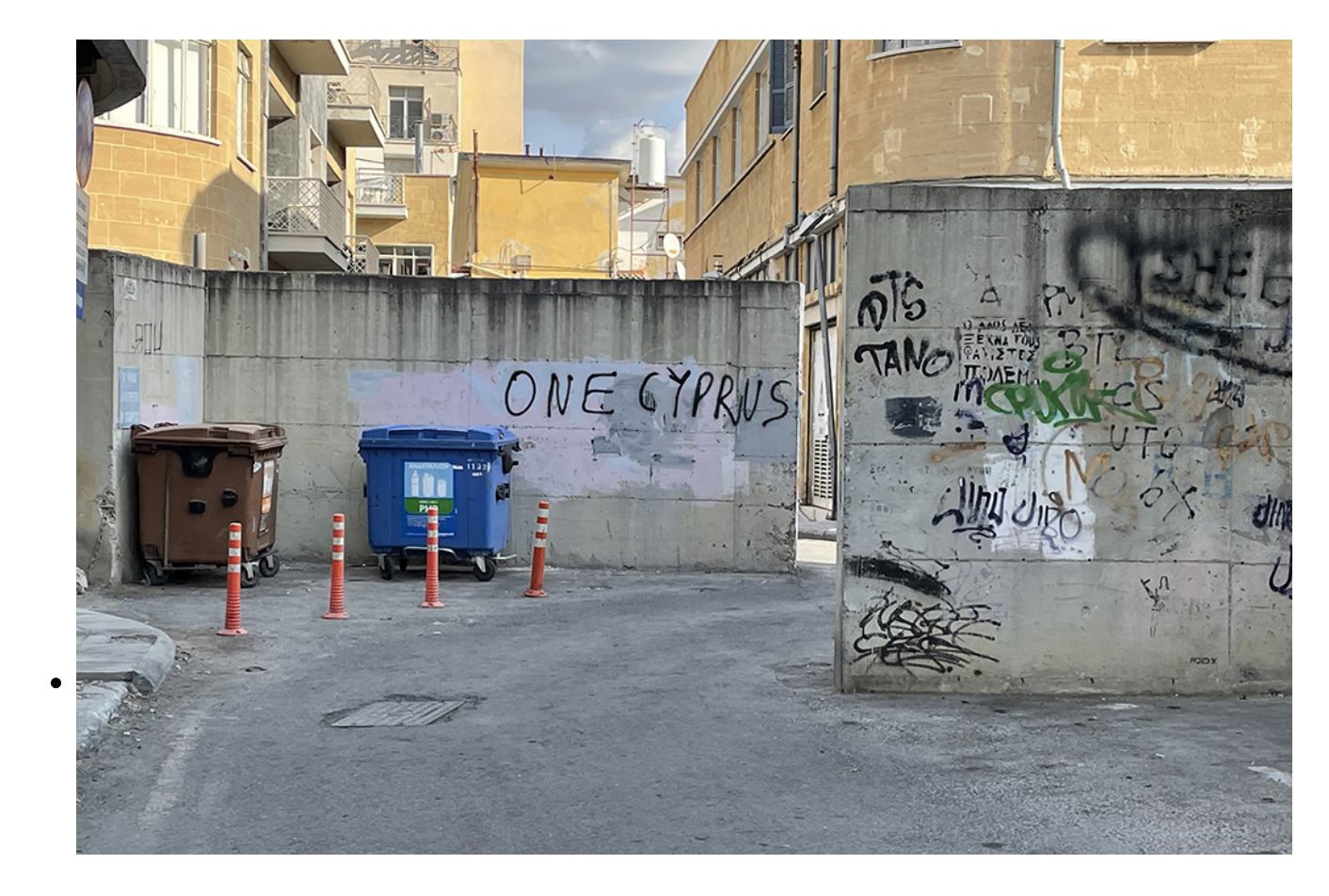
"One Cyprus" graffiti outside of the U.N. buffer zone that divides Nicosia.

Migration has taken center stage during Francis' first 24 hours in Cyprus, which has more refugee arrivals than any other country in the European Union, with the <u>pope telling</u> both church and civic leaders on his first day in the country that welcoming new arrivals is "precious" work.