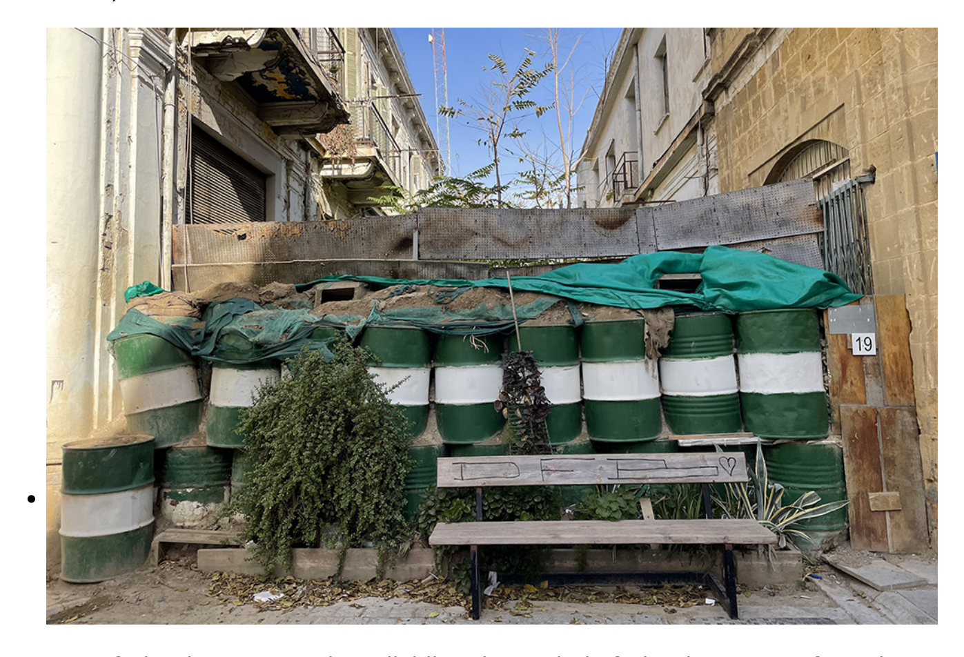
Part of Nicosia's "Green Line" dividing the capital of Nicosia, as seen from the Greek-controlled south. (NCR/Christopher White)

Nicosia's old city walls, as seen from the U.N. buffer zone. (NCR/Christopher White)