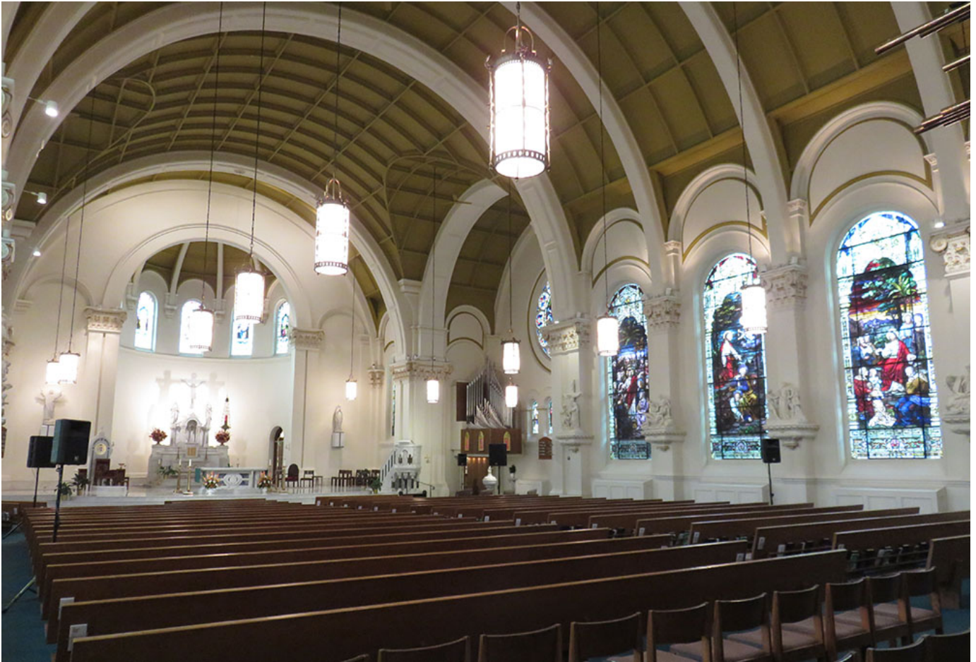
The interior of the Cathedral of Our Lady of Lourdes in Spokane, Washington

The Spokane diocese — led by Bishop Thomas Daly, an outspoken conservative prelate — received $10,000 for its annual Catholic appeal and $500 to support a local Catholic school. The Cathedral of Our Lady of Lourdes in Spokane was given $15,000 for general operations.