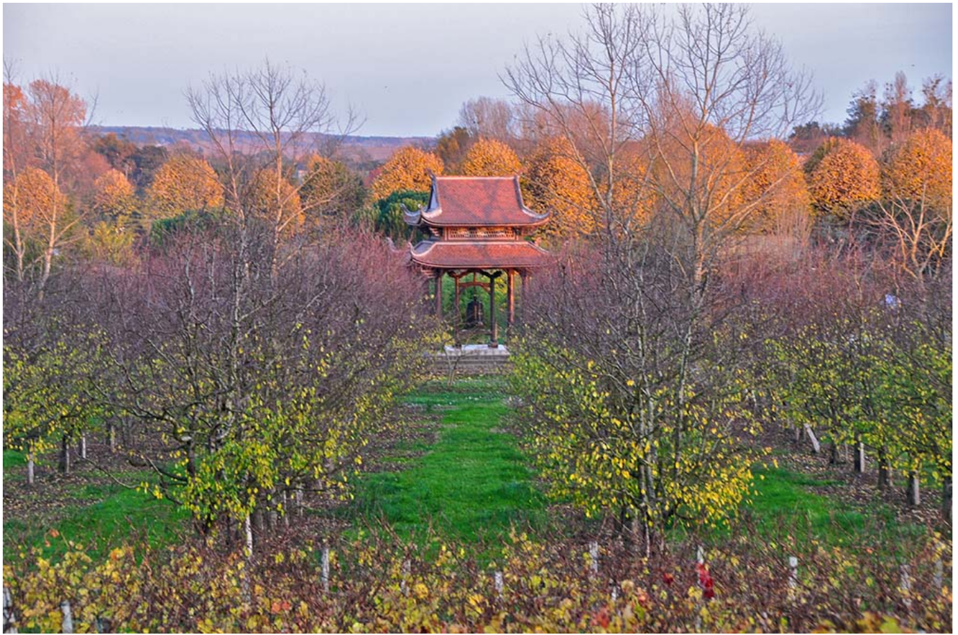
A view of the grounds of Plum Village in France

It was then Nhất Hạnh founded his international retreat center, called Plum Village , near Bordeaux in southwest France, his first Western monastic community. For decades, that would be his new home.