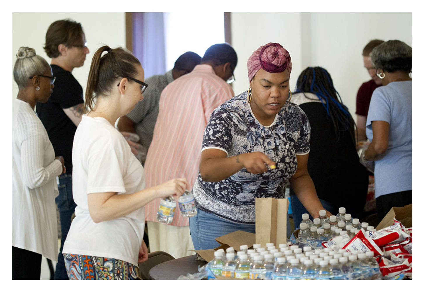
Parishioners at Holy Name of Jesus Church in Washington pack lunches for the poor June 25, 2017.

If our public witness isn't always evangelizing in this broad sense, we are just another private country club, another gated community in a world of increasingly growing inequity and isolation.