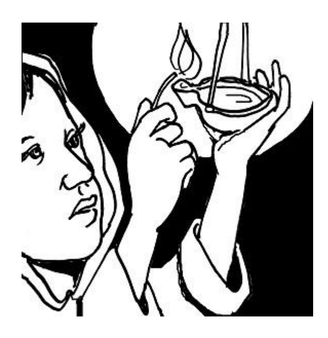
"To one who has, more will be given" (Mark 4:25).