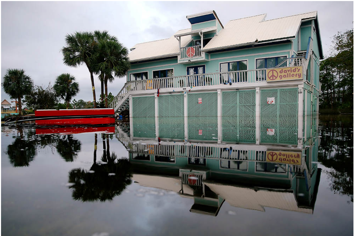
A house in Gulf Shores, Alabama, is surrounded by flood waters Sept. 17, 2020, after Hurricane Sally swept through the area.