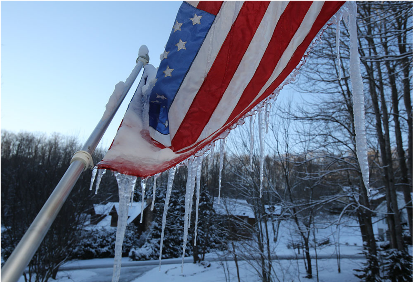
Icicles hang from a frozen U.S. flag on the front porch of a home in Waynesville, North Carolina, Dec. 26, 2020.