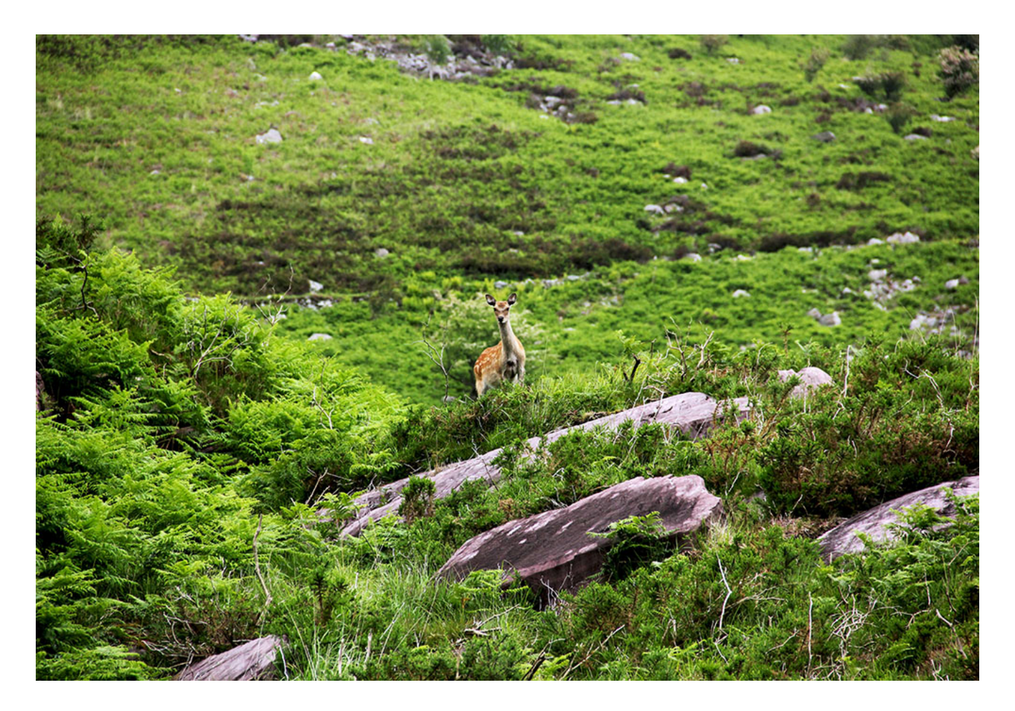
A doe deer in green grass at the Gap of Dunloe, Ireland

The Lorica, a Trinitarian prayer invoking the main characters of salvation history, also invokes the powers of the created world. "I bind to myself to-day," he prayed, to: