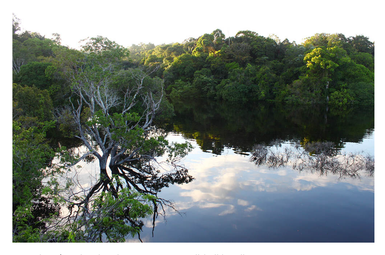
Dawn in Jaú National Park, Amazonas, Brazil