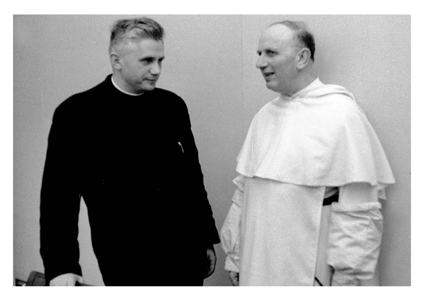
Fr. Joseph Ratzinger is seen with French Dominican Fr. Yves Congar during the Second Vatican Council in 1962. Ratzinger, who became Pope Benedict XVI, gained a reputation as a progressive theologian during Vatican II.