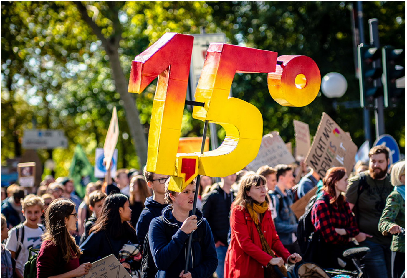
Fridays For Future, Sept. 20, 2019 in Bonn, Germany

The IPCC said that global emissions have to peak no later than 2025 to keep 1.5 C in range, and emissions need to be cut nearly in half by 2030 and reach net-zero by 2050. Even then, the report estimates that average temperature rise will likely