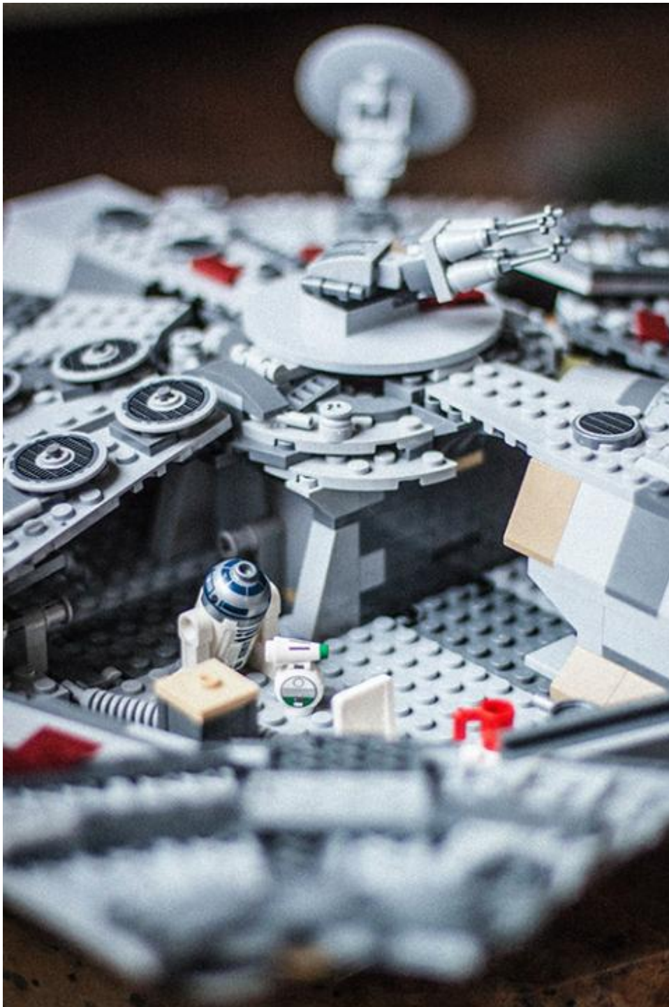
Lego "Star Wars" minifigures of droids R2-D2 and D-0 inside a Lego model of the Millennium Falcon ship.

It's the job of a parent to help children envision what life should be like, how society should function. What should be deemed important and essential and valuable. How we should treat one another. To expand the young imagination beyond the