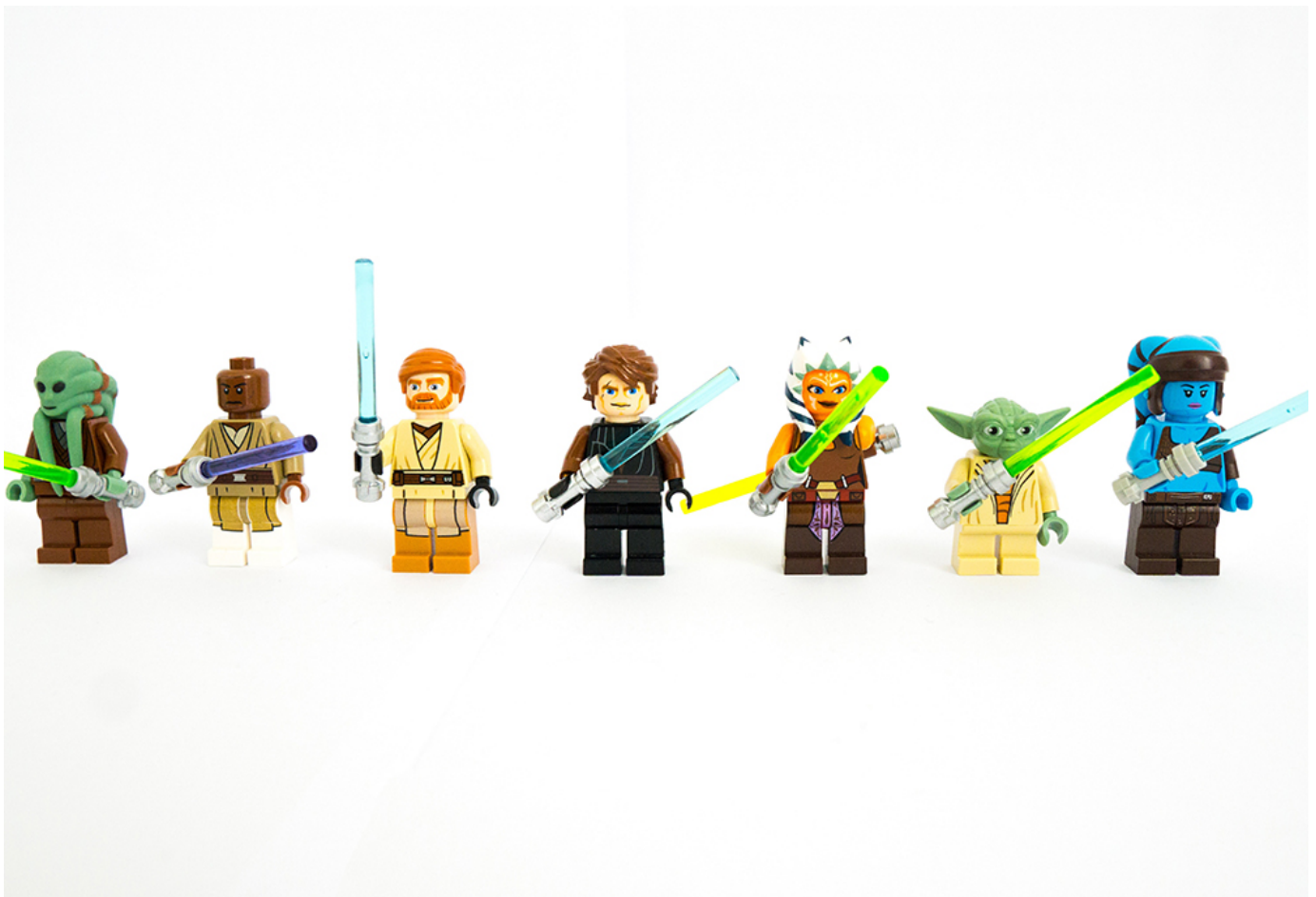
LEGO "Star Wars" minifigures are pictured, including (from left) Kit Fisto; Mace Windu; Obi-Wan Kenobi; Anakin Skywalker; Ahsoka Tano; Yoda; and Aayla Secura.

Our own participation in the Easter story. But we don't participate alone.