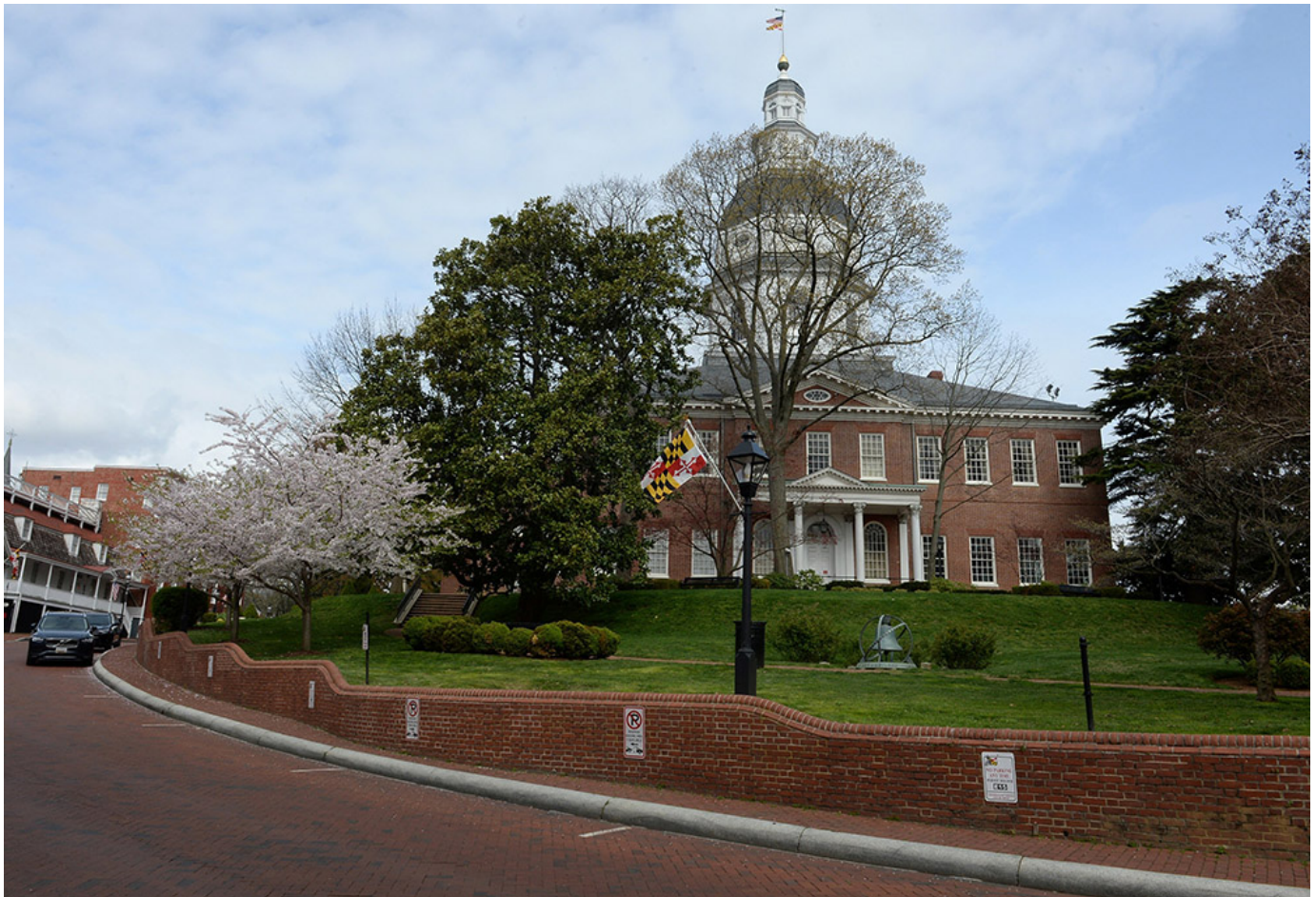
The Maryland State House is seen March 31, 2020, in Annapolis.

What is telling — and predictive of things to come — is that the abortion bill was the only one the Post connected to Hogan's Catholicism as problematic.