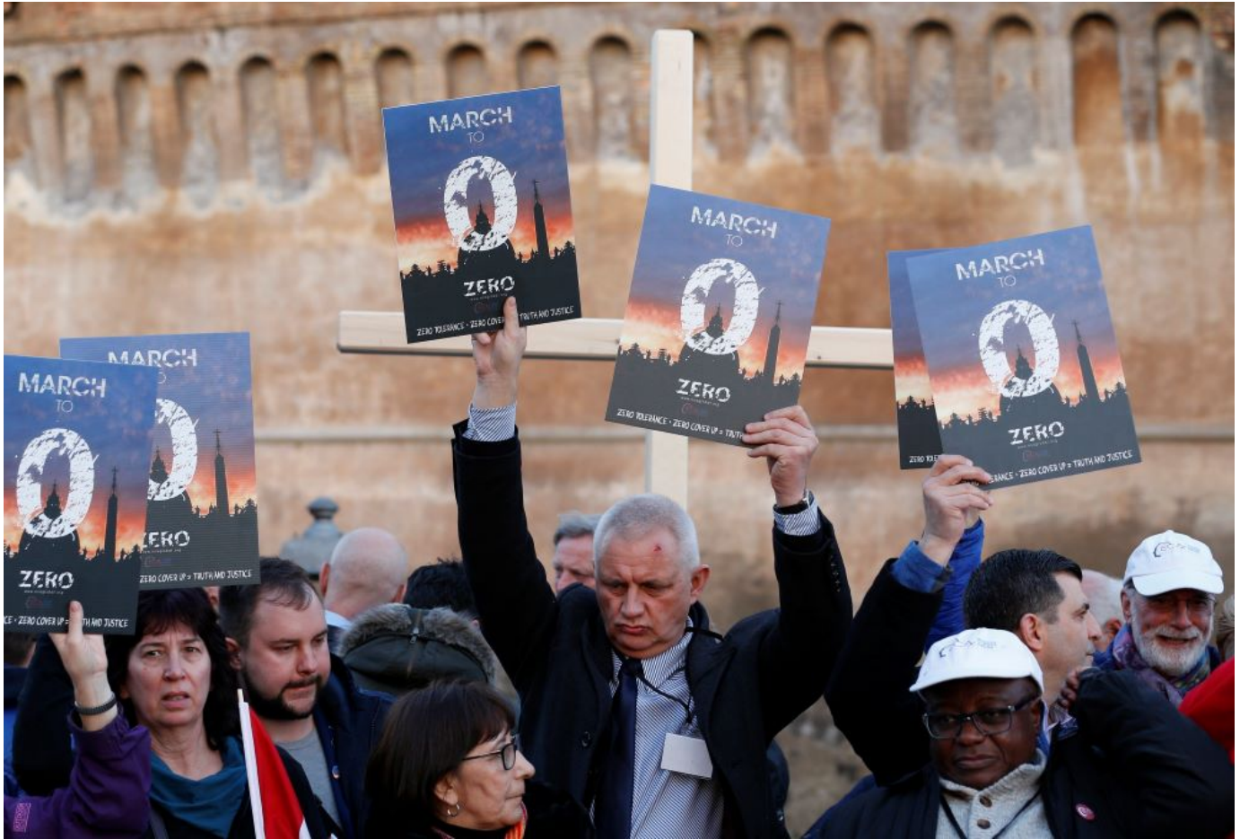
Clerical sex abuse survivors and their supporters rally outside Castel Sant'Angelo in Rome in this Feb. 21, 2019, file photo.