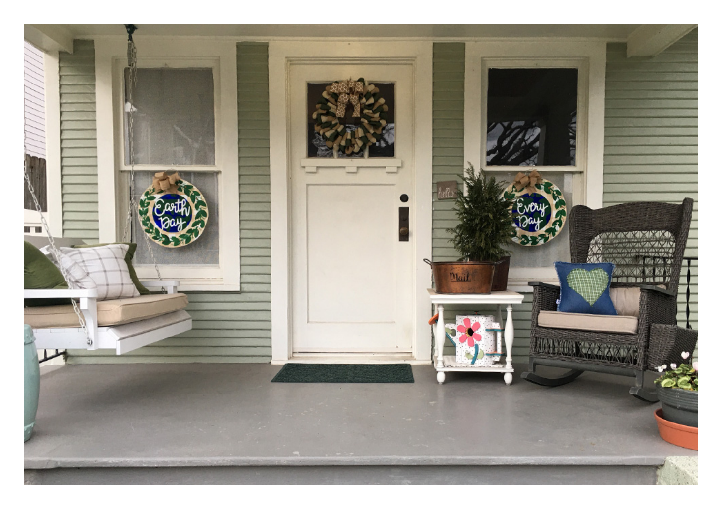
Anne's front porch