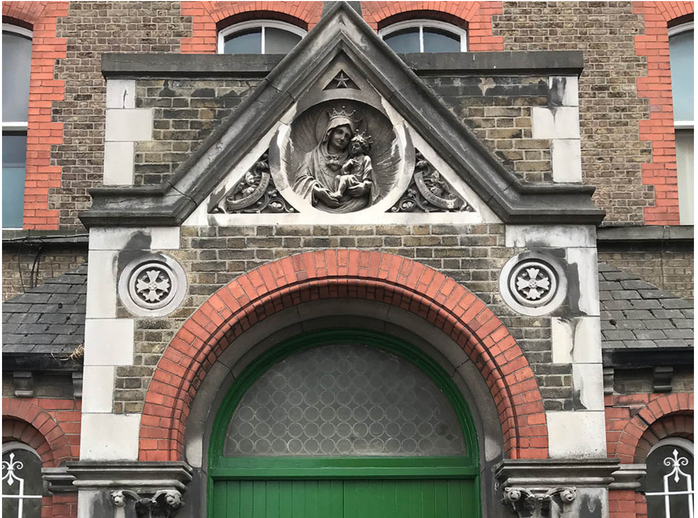
The archway above the entrance to Our Lady of Charity, the now-derelict Magdalene laundry on Sean McDermott Street in Dublin

But women who became pregnant out of wedlock, who had been raped or abused, who had been deemed "promiscuous" or who were unwanted by their families were another story. They were considered a shame to the nation. They were to be contained, controlled, kept out of sight.