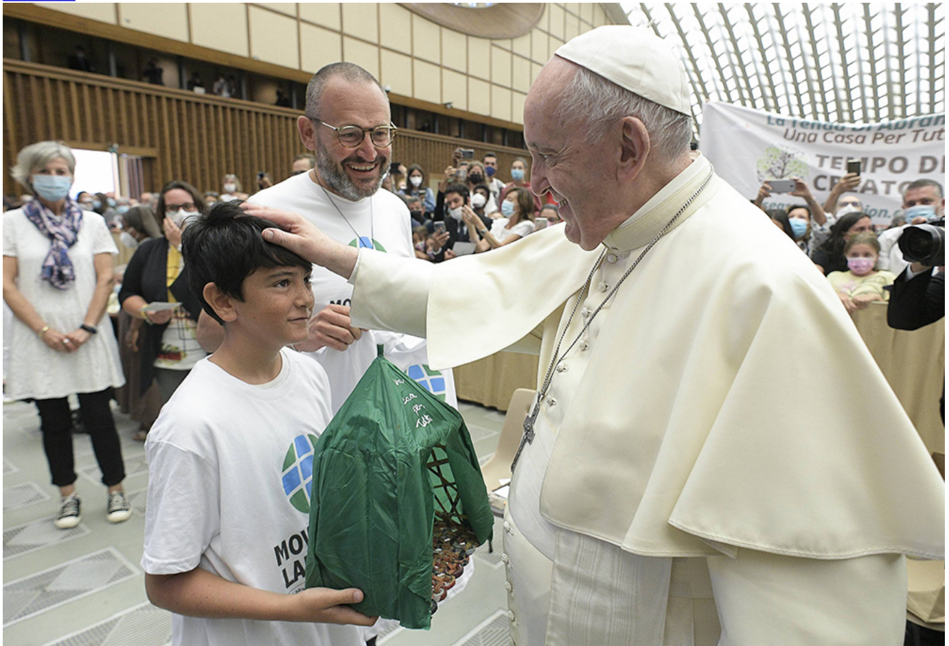
Pope Francis accepts the gift of a handmade "Abraham's tent" from a boy during his general audience in the Paul VI hall at the Vatican Sept. 1, 2021. The gift was given by members of the Laudato Si' Movement.