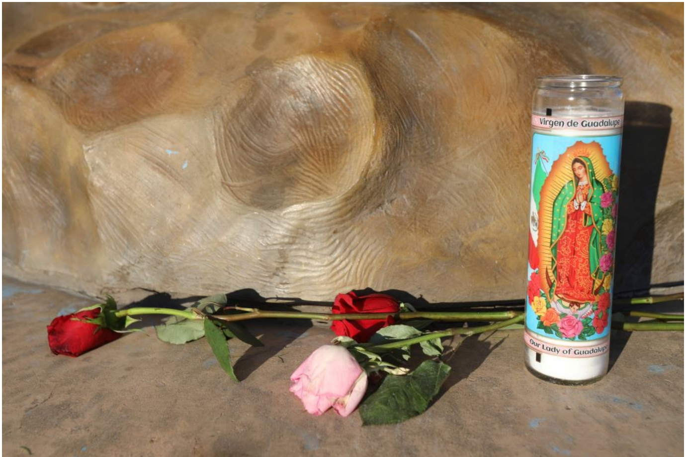
A candle and roses are pictured outside the Sanctuary of Our Lady of Guadalupe in Santa Fe, N.M., May 20, 2021.