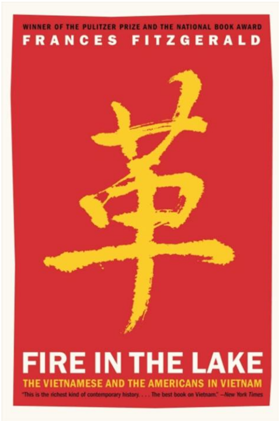
Cover of "Fire in the Lake" by Frances FitzGerald

Fire in the Lake — a book I remember as essential reading for anyone studying the war in college, as I did, in the late 1970s — was bafflingly left off a suggested reading for Ken Burns' PBS 2017 documentary on the war . Why? Apparently because