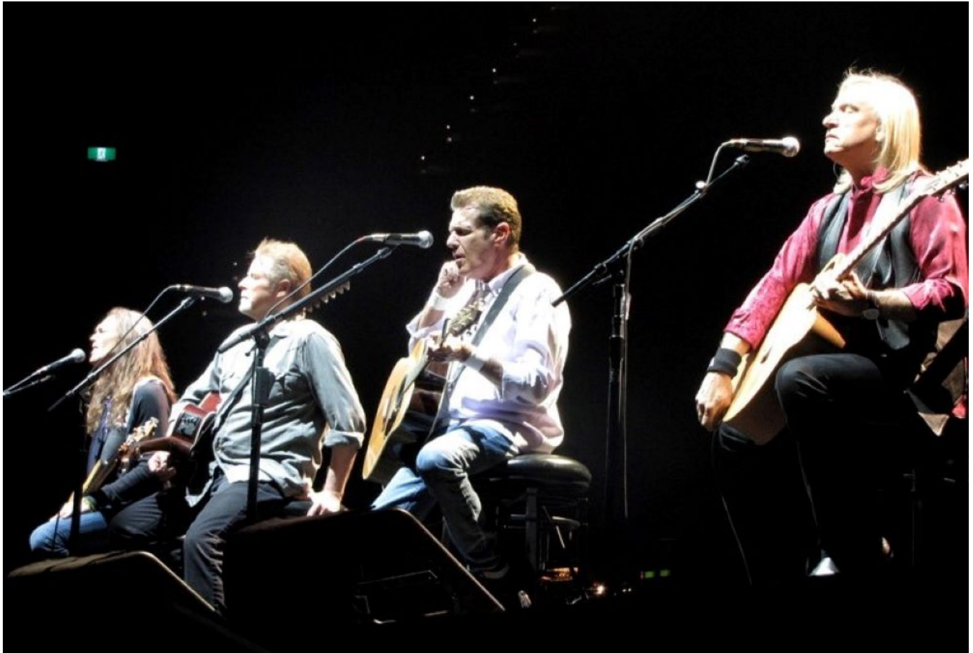
Eagles in concert Dec. 17, 2010, at Rod Laver Arena in Melbourne, Australia