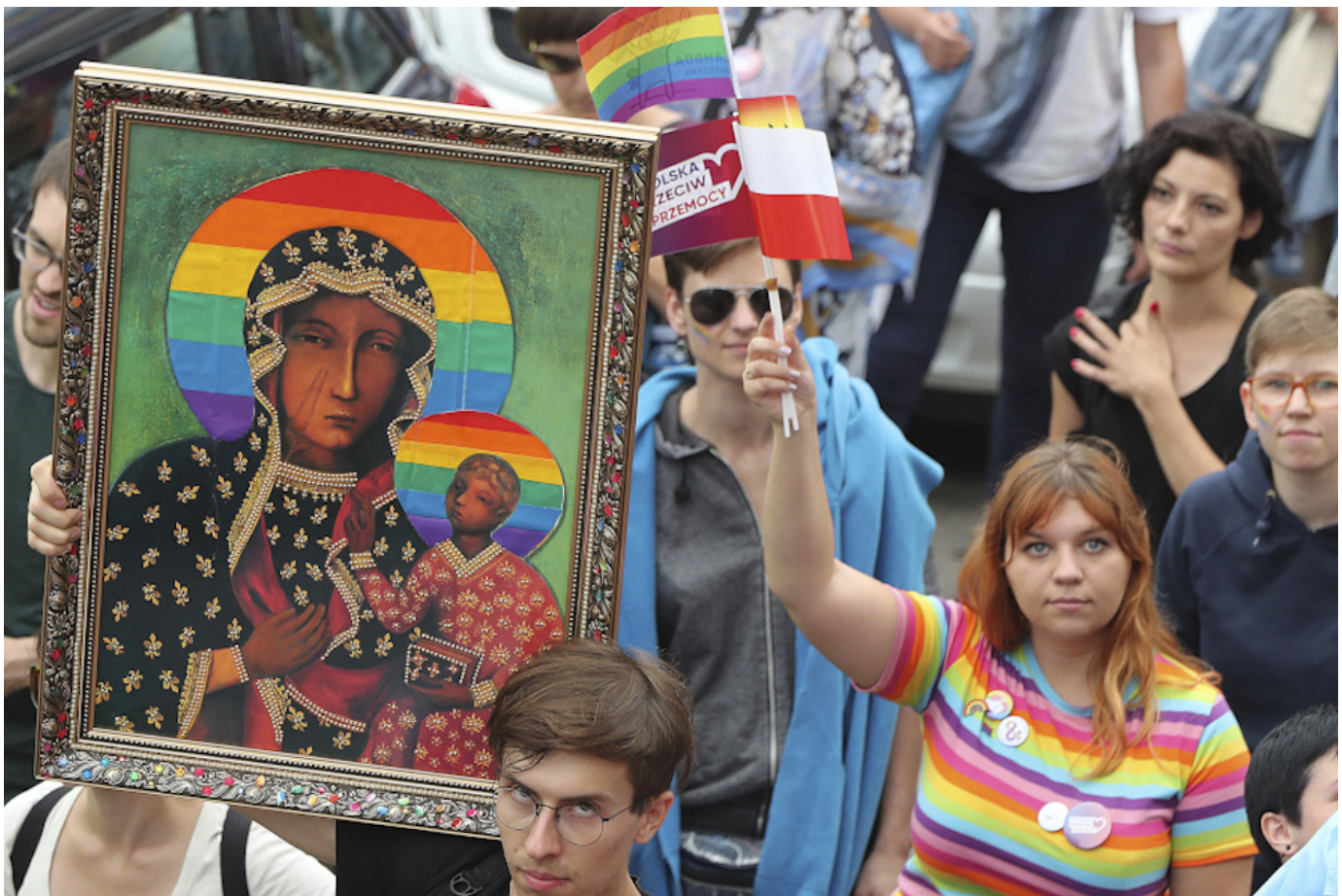
LGBTQ activists and supporters gather for the first-ever pride parade in the central city of Plock, Poland, on Aug. 10, 2019.

"In all honesty, if you had told us as young boys who wasted countless hours of our lives in church trying to 'pray the gay away' that we someday would be standing in front of all of you in our Catholic Church talking about our family on Father's Day, we would never have believed you," they said in their reflection.