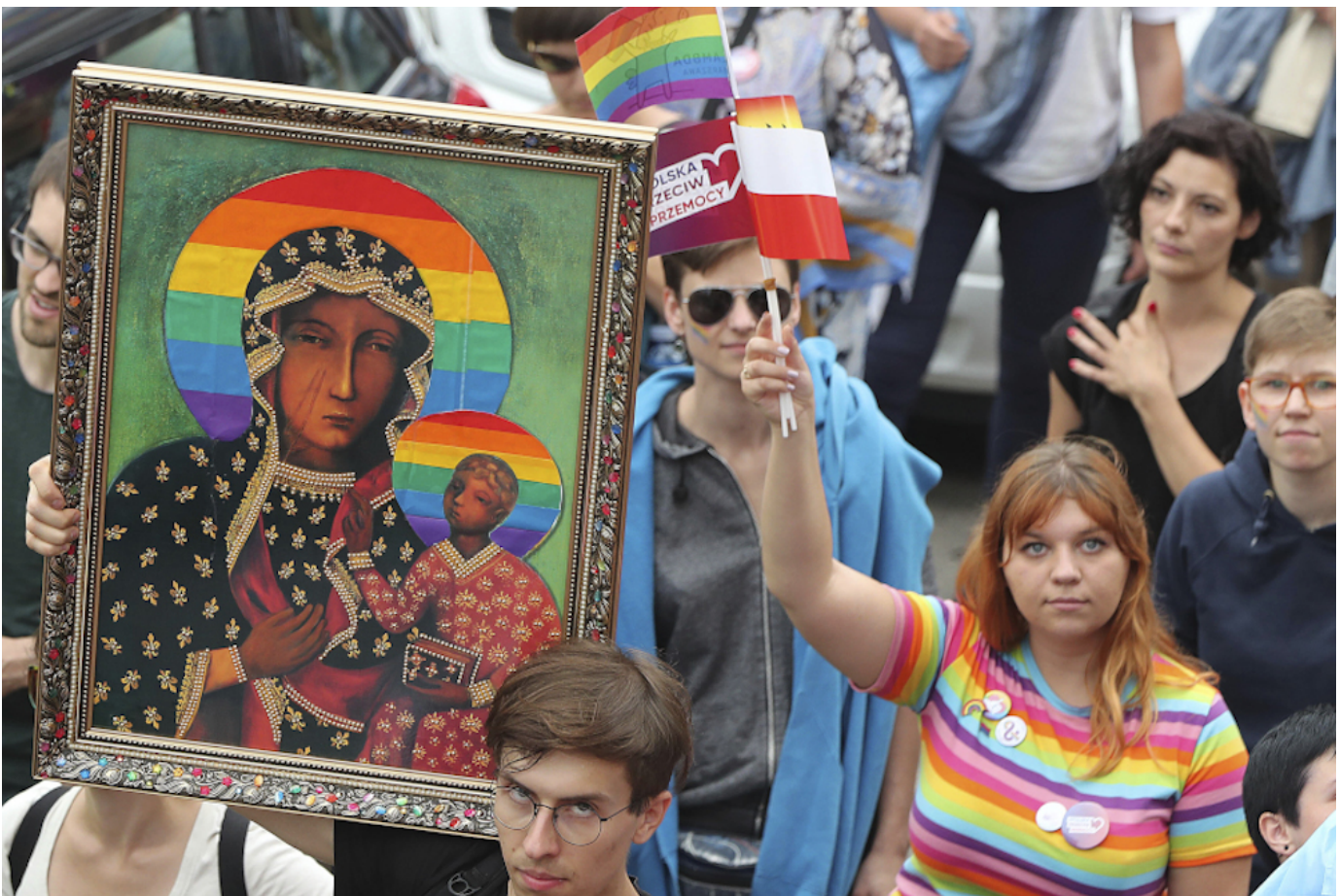
LGBTQ activists and supporters gather for the first-ever pride parade in the central city of Plock, Poland, on Aug. 10, 2019.

"In all honesty, if you had told us as young boys who wasted countless hours of our lives in church trying to 'pray the gay away' that we someday would be standing in front of all of you in our Catholic Church talking about our family on Father's Day, we would never have believed you," they said in their reflection.