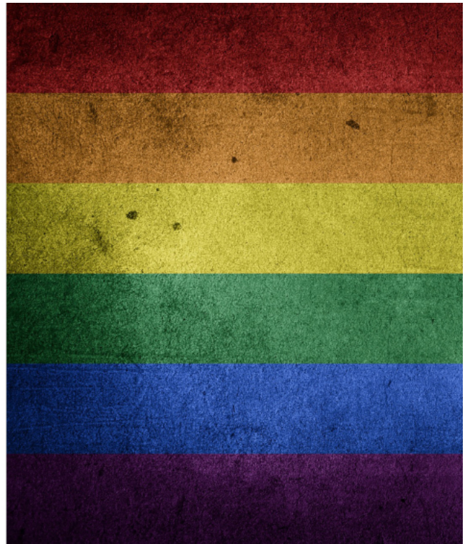
The Vatican City flag, left, and a pride flag.