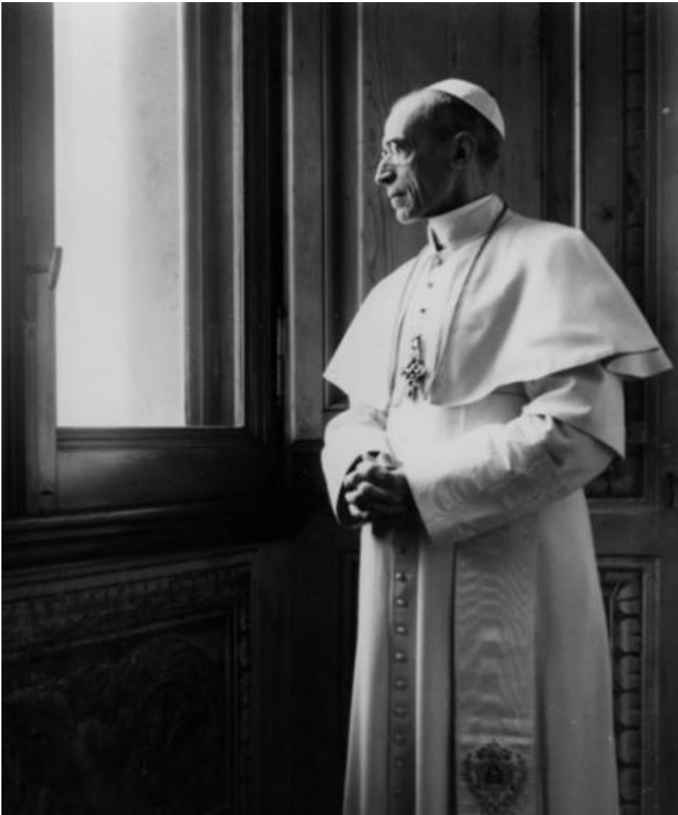
Pope Pius XII, who led the Catholic Church from 1939 to 1958, is pictured in this undated photo at the Vatican.