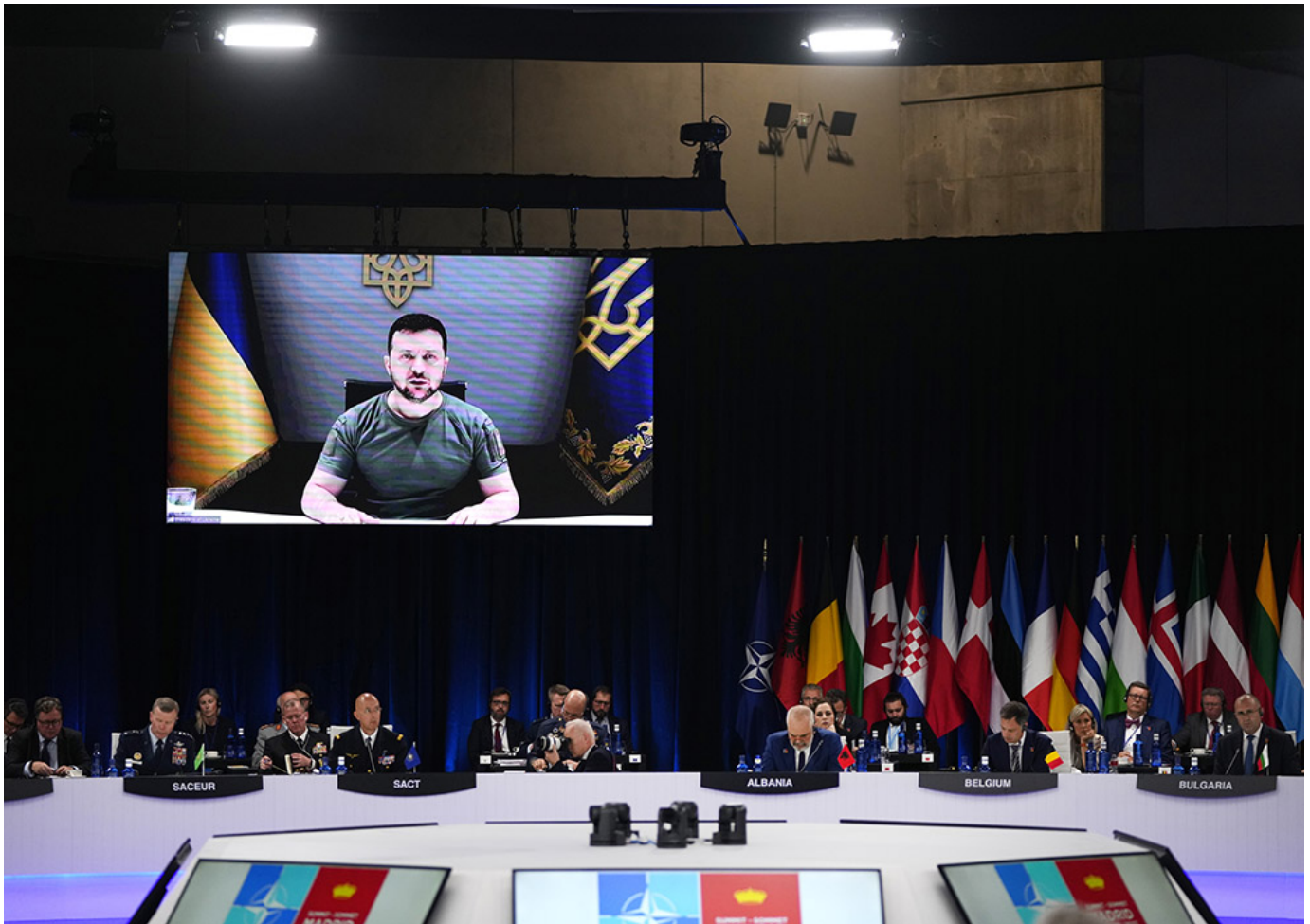
Ukraine's President Volodymyr Zelenskyy addresses leaders via a video screen during a roundtable meeting at a NATO summit in Madrid June 29.

Similarly, in 2014, one could have invoked Mearsheimer's own power-balancing rationale to argue for admitting Ukraine into NATO as a way to "contain" Russia's rising power not only in Belarus but also in Syria, Iran, Libya and Mali, which are far from any romanticized ancient Slavic empire .