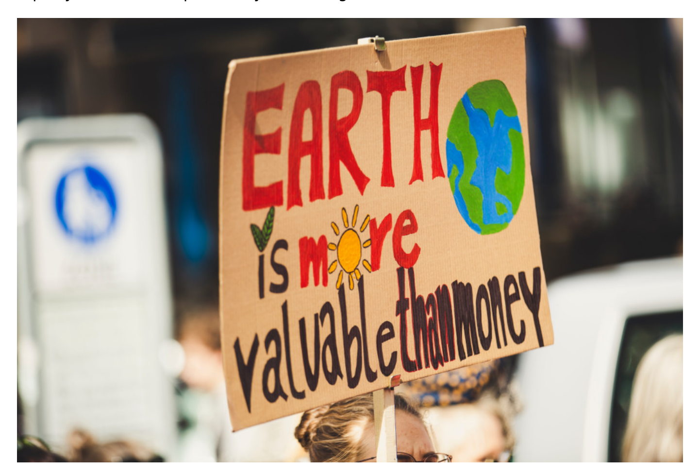
A sign at a global climate change strike in Lorenzer Platz, Nuremberg, Sept. 20, 2019.