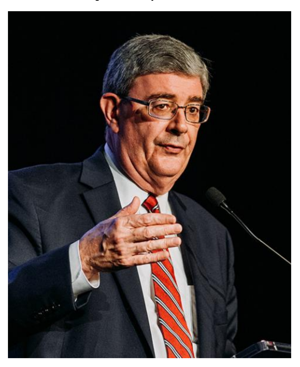
George Weigel speaks at the Napa Institute's 2019 Summer Conference in California.

All these "either/or" propositions are not very Catholic. The Catholic intellectual tradition is humanistic; it seeks to combine and connect; it is characterized by "both/and" thinking; it seeks synthesis.