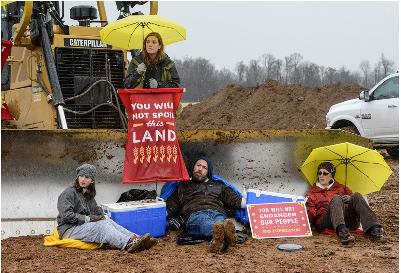
Activists with Lancaster Against Pipelines block construction of a pipeline Nov. 18, 2017, in Holtwood, Pennsylvania.