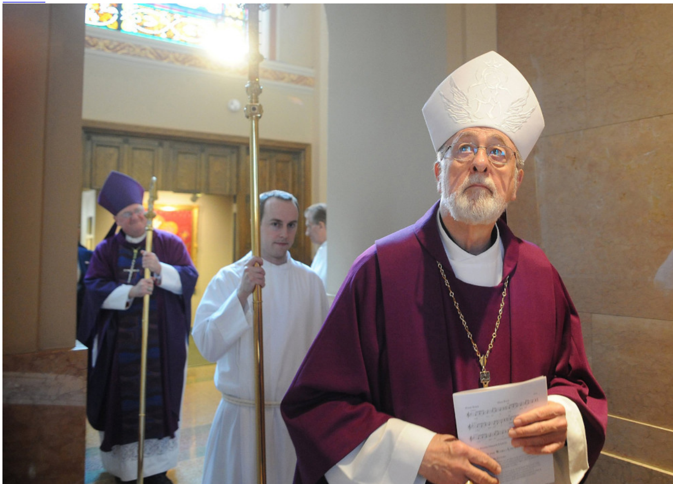
Retired Archbishop Rembert Weakland of Milwaukee enters St. John the Evangelist Cathedral in Milwaukee March 29, 2009.