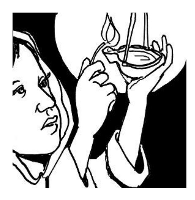
"At midnight there was a cry, 'Behold, the bridegroom! Come out to meet him" (Matt 25:5).