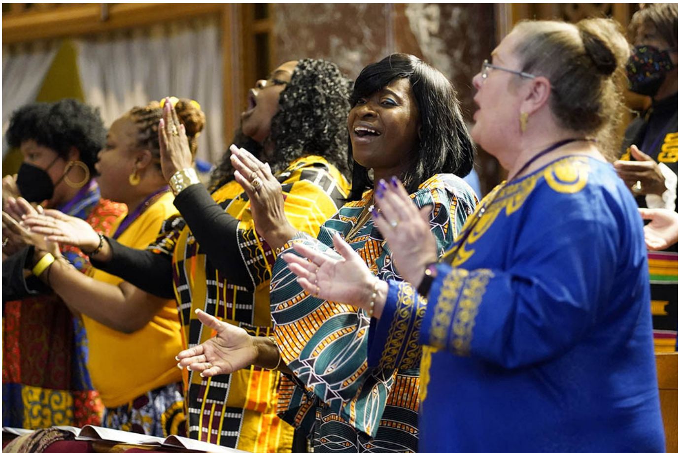
Members of a gospel choir named for Franciscan Sr. Thea Bowman, a Black American candidate for sainthood, sing during a Black History Month Mass of thanksgiving at Immaculate Conception Church in Queens, New York, Feb. 20.