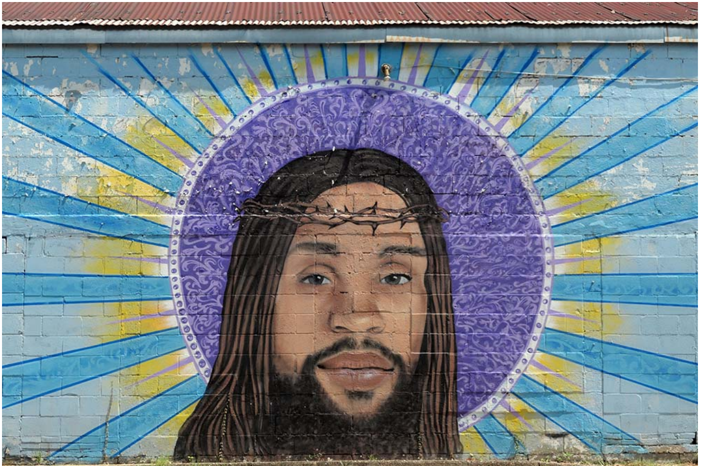
A mural of Jesus at the Way Jesus Christ Christian Church in New Orleans

These verses related to justice are only a few of many, many more found in the Bible. And yet somehow white Christians have found ways to ignore these verses that are at the heart of their sacred scripture. Meanwhile, the Black church has read them and found a God who is on their side, a God who identifies with their suffering — a God who is with them. In the stories of the Hebrew slaves' exodus into freedom and Christ's suffering at the hands of his oppressors, Blacks found a God who no longer wore a white man's face.