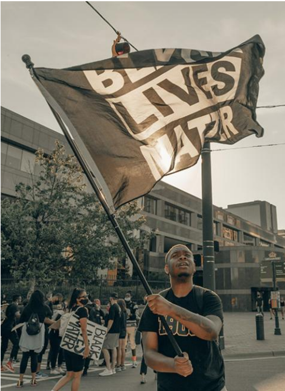
Charlotte, North Carolina, 2020

As we become aware of the Divine Presence within the suffering of the Black community, we are challenged to affirm, "Black lives matter." And yet I have had friends counter this statement with the response that "all lives matter." Of course all lives matter; that should be a self-evident fact. But for centuries, Western society has been built around the assumption of white supremacy. We do not need to assert that "white lives matter," because no one has ever contradicted that fact.