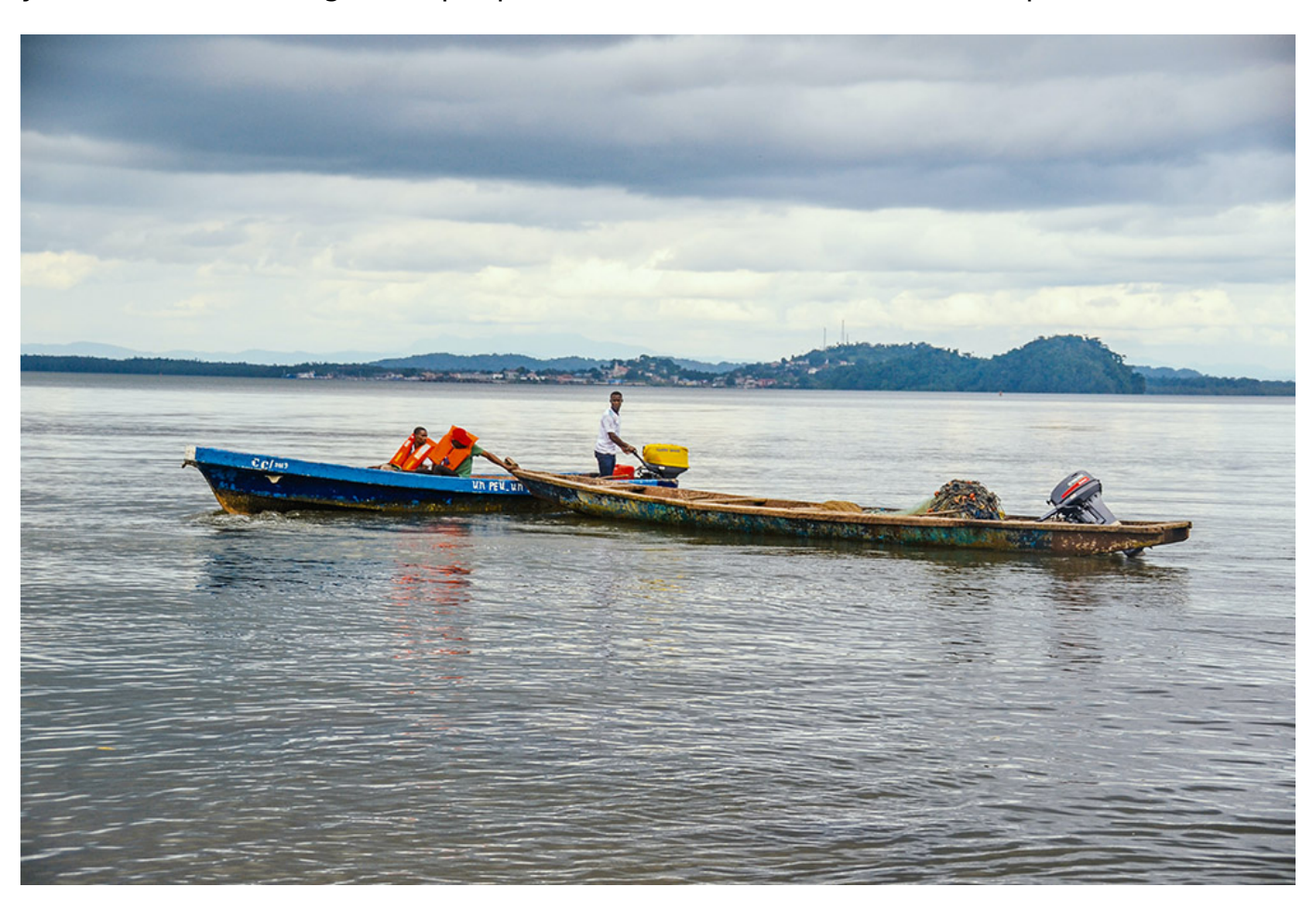
Fishing at Cocobeach in northwest Gabon

During its side event, the Africa Faith Actors Network on Climate Justice developed key asks for the COP27 presidency. The network urged COP27 restore the trust of the people by honoring the commitment to support adaptation and mitigation strategies in Africa and by making the Egypt summit fully inclusive by involving youths, women, Indigenous people and faith actors involved in the processes.