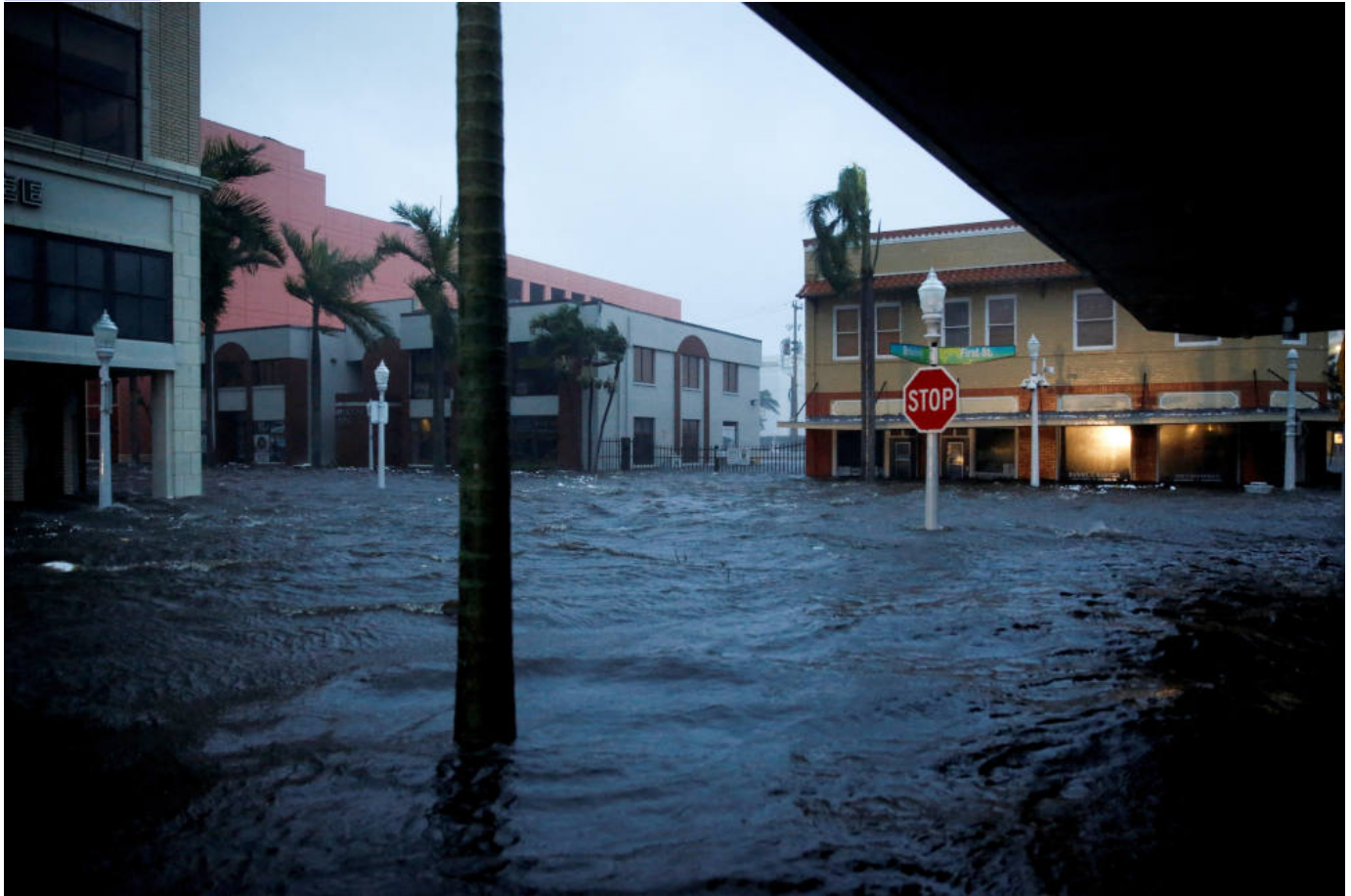
Floodwaters cover a road after Hurricane Ian made landfall in Fort Myers, Fla., Sept. 28, 2022.