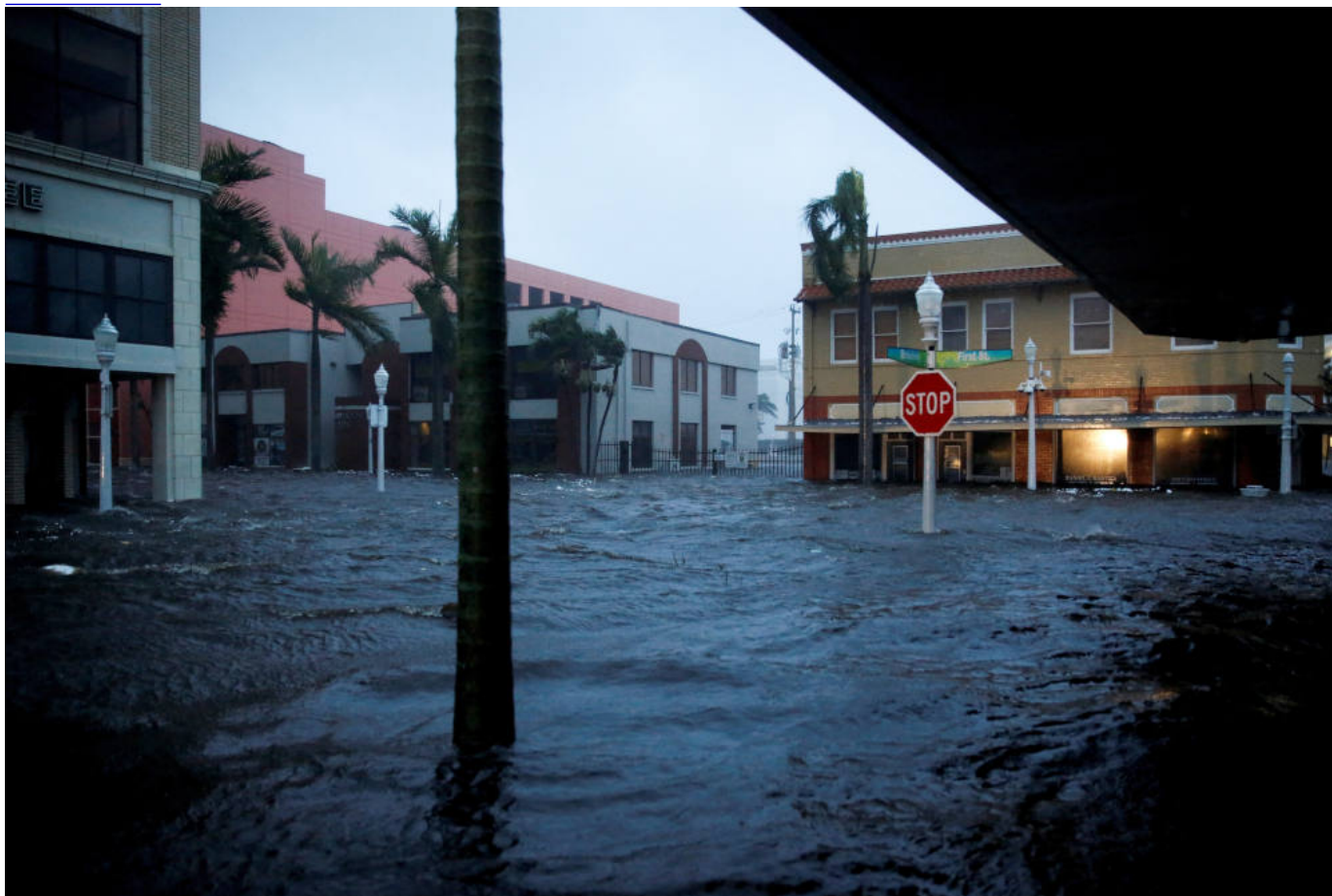
Floodwaters cover a road after Hurricane Ian made landfall in Fort Myers, Fla., Sept. 28, 2022.