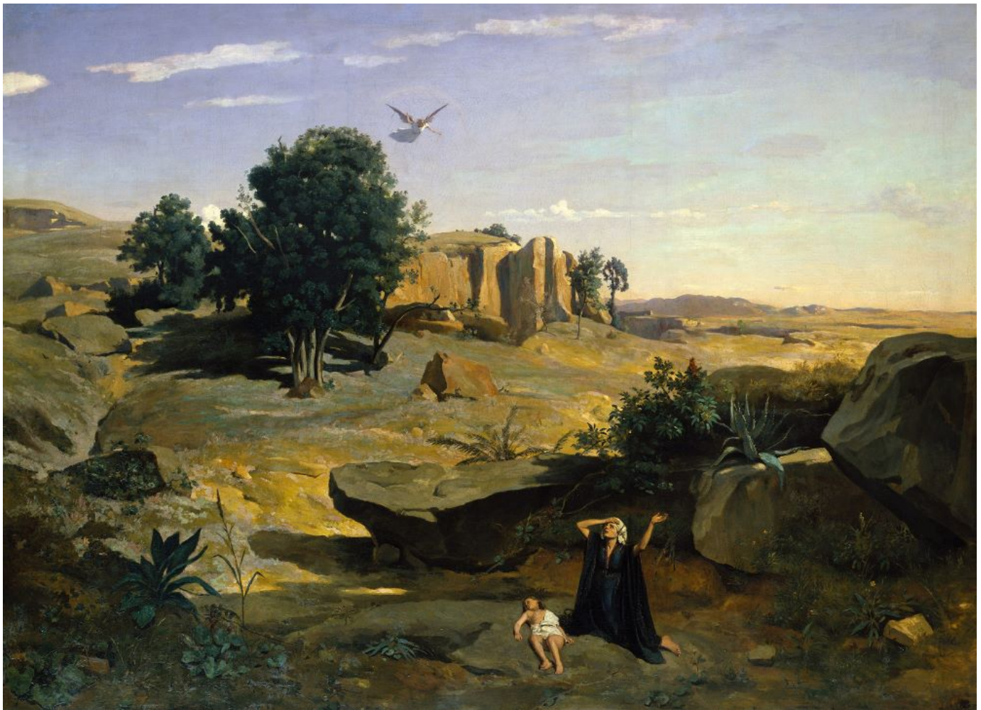
"Hagar in the Wilderness" (1835) by Jean-Baptiste-Camille Corot