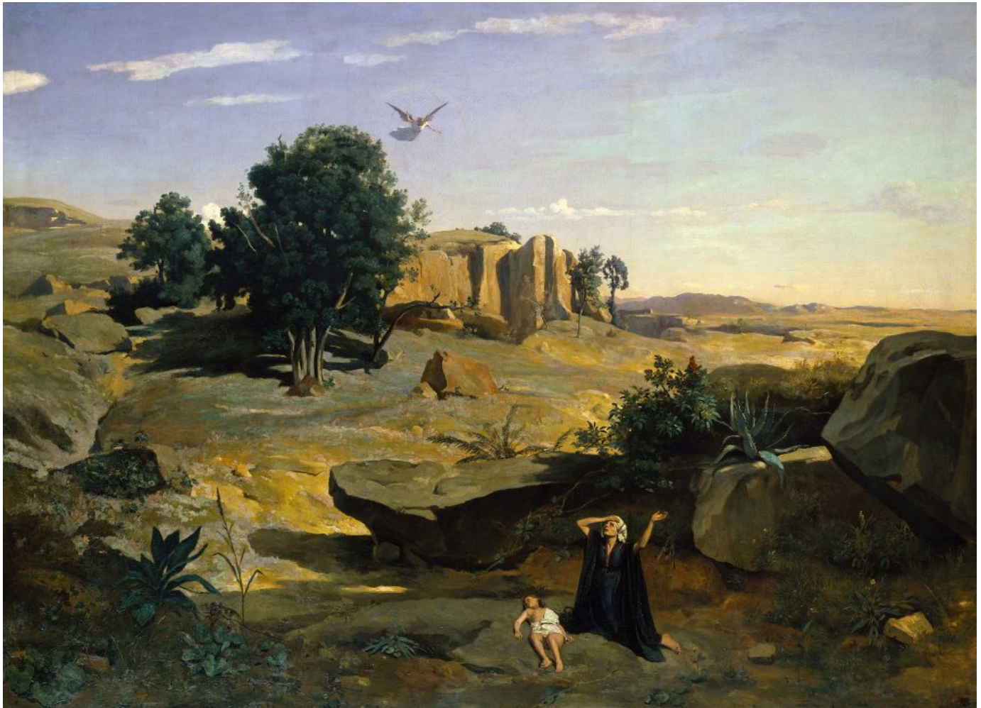
"Hagar in the Wilderness" (1835) by Jean-Baptiste-Camille Corot